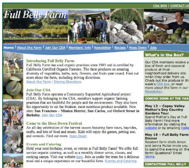
The website of Full Belly Farm, Guinda, Calif., gives details about their products, markets, CSA, staff, events, and more. www.fullbelly.com