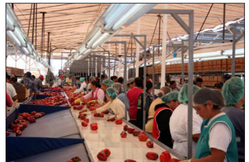
Packing bell peppers. www.ceriverside.ucdavis.edu