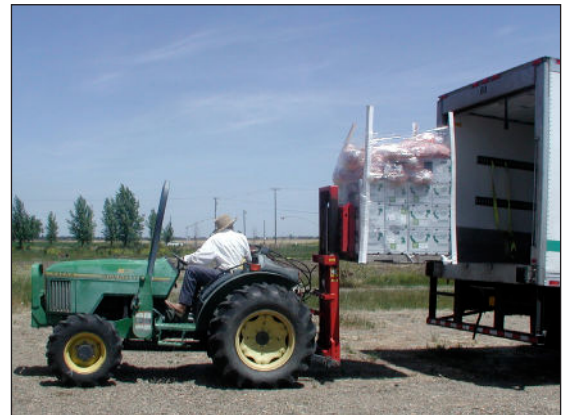
Transferring produce from the cooler for delivery to local schools in Davis, Calif. www.caff.org