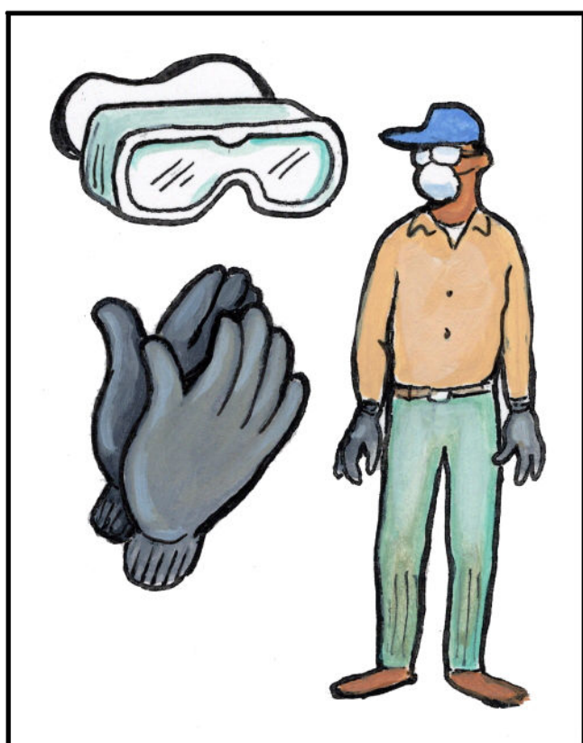
Longc horpc nyei zorong-mbungh jaa-sic fai jaa-muotc. (PPE)

Haaix zanc meih maaiz doc gaeng ndie doqc mangc longx sou-daan (label). Maiv gunv meih zinh ndaangc longc jiex nyei. Oix zuqc bieqc hnyouv caux ei jienv sou-daan njaaux.