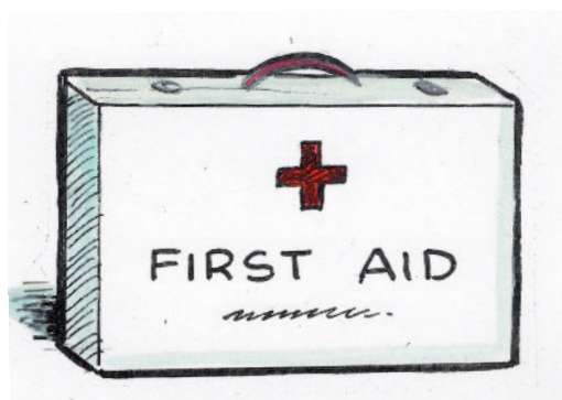
Hiuv taux First Aid njaaux nyei fiex.

Oix zuqc forv jienv an ndie dorngc, yaac maaih nzaangc naetv jienv.