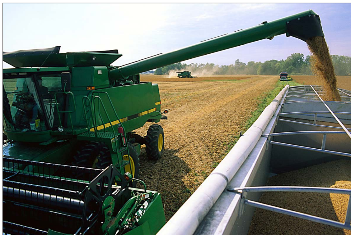
Nutrients leaving the field.