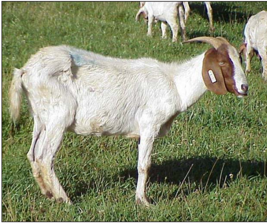
This goat shows signs of severe parasite infection.

a “reservoir” that will protect the larvae from weather extremes (Leathwick et al., 2011). Several researchers have studied the vertical migration (how high on the grass blade the larvae are found) and the results are discouraging; larvae may be found at the top of the grass blades, more than 20 cm high (about eight inches) (Amaradosa et al., 2010; Gazda et al., 2009; Santos et al., 2012; Silva et al., 2008). However, most of the larvae are usually found near the base of the plant, especially during dry periods.