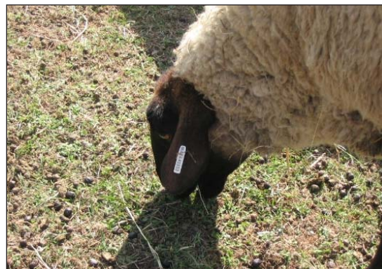
This sheep is getting no nourishment but plenty of parasites in this situation.

If your pastures always seem “too short” and you aren’t able to give them enough rest time