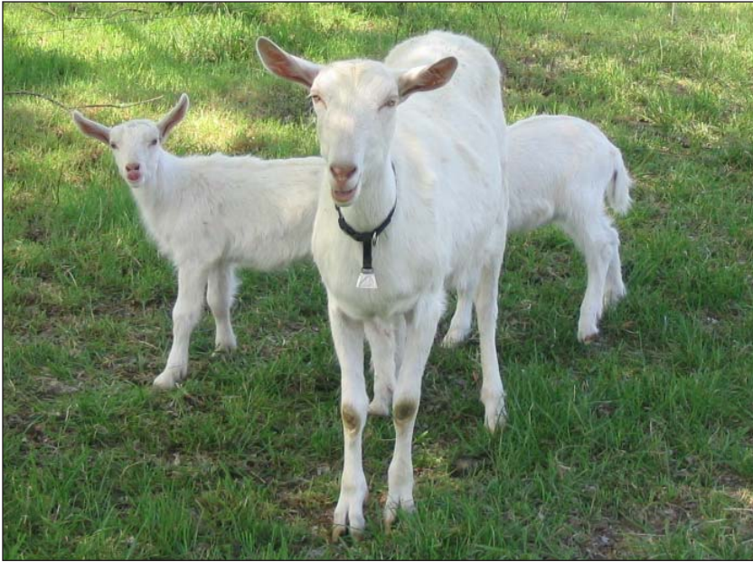
This young doe is still growing and is feeding twins. She is at risk for increased parasite infection because of these stresses.

100 g of cottonseed meal (31% crude protein) per head, per day, but were fed just twice weekly, at 350 g per feeding, to lower labor cost. The supplemented lambs had 44% higher gains than lambs without supplement, and 35% lower FEC (Eady et al., 2003). In Missouri, young lambs that were fed \frac{1}{4} pound of soybean meal per day had higher gains and higher hematocrits (showing less anemia, expressing greater resistance to H. contortus ) (Ross, 1989). Some experimentation will be necessary in your situation. In addition to protein, consider minerals, especially copper and zinc, which are associated with the immune system (Sykes and Coop, 2001). Also, when energy is limiting, an energy supplement is helpful (Valderabano et al., 2002; Hoste et al., 2005). Supplementation of protein and energy can be provided through better-quality pasture, and this may be more economical than purchased supplements. Planting more legumes on the farm will improve soil and will improve the nutrition available to the animals. See ATTRA's Ruminant Nutrition for Graziers for more information and consult your local Cooperative Extension Service to learn about legumes and other forages that may do well in your area.