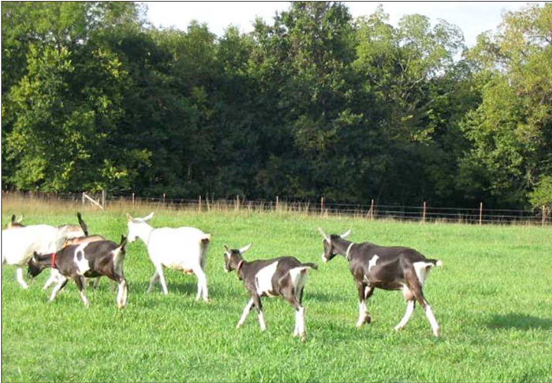
Good pasture management and attention to nutrition help raise healthy small ruminants.