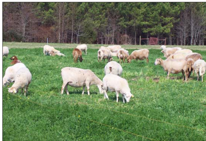
Rotational grazing sheep.

A summary of SARE-funded work done by the ACSRPC is collected in this article: www.sare.org/Learning-Center/Fact-Sheets/National-SARE-Fact-Sheets/Sustainable-Control-of-Internal-Parasites-in-Small-Ruminant-Production