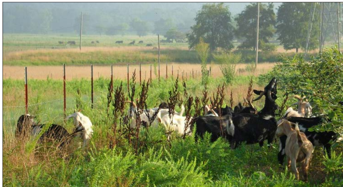
Three useful strategies for internal parasite management are shown here: use of browse, bioactive forages ( sericea lespedeza ), and alternate grazing (see cattle in the background). Plenty of available forage offers more protection.

Proper pasture management can reduce the number of parasites ingested by sheep and goats, keeping parasite burdens low. This publication discusses techniques for managing parasites on the pasture and for increasing grazing animals' resistance to parasites through improved nutrition. Pasture management is a vital component of a holistic parasite management strategy.