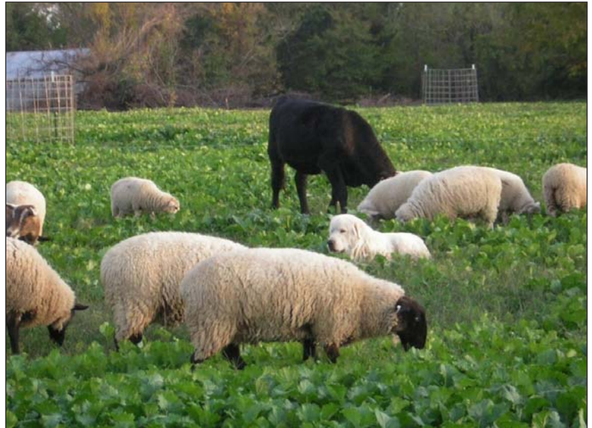
Grazing turnips in the fall provides sheep and goats with “clean” grazing and excellent nutrition during breeding season.

Maintaining adequate forage height is important for avoiding parasite infection and providing good