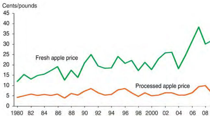
Figure 1. U.S. Grower Prices for Apples