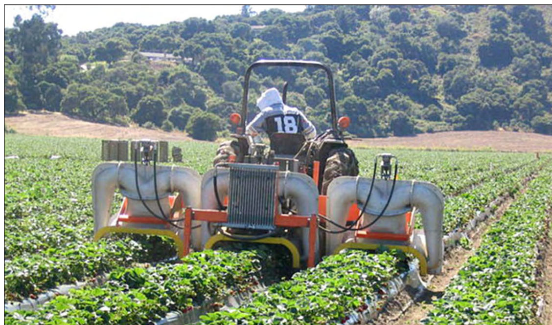
Careful planning is essential for profitable farming.

This publication was supported by the Beginning Farmer and Rancher Development Program of the National Institute of Food and Agriculture, U.S. Department of Agriculture, grant number 2010-49400-21733.