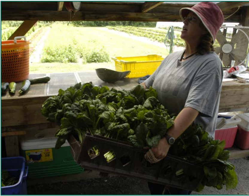
Community Supported Agriculture (CSA) Bivalve MD.

livestock products. The subscribers pay at the beginning of the season for part of or their entire share of the farmer's planned production. This eliminates the problem of covering up-front production costs at the beginning of the season and guarantees a market. The challenge for the grower is to have a consistent and continuous supply of popular vegetables throughout the growing season. It is helpful to survey the customers or members about their preferences before planting. Refer to ATTRA's publication Community Supported Agriculture for more information.