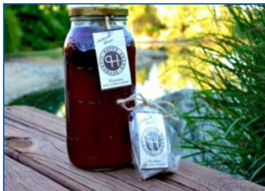
Compost tea in liquid and bag form.

A producer has the option of selling compost tea in a ready-to-apply liquid form or a ready-to-brew tea bag. Because the product is dry, the tea bag option weighs less and has less potential for spillage, making it a better option for shipping and storage.