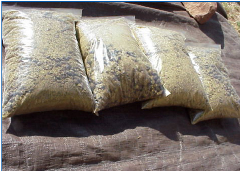
Economically packaged sheep manure.

Bulk aged manure, like bulk raw manure, can be loaded directly into a truck bed or trailer, eliminating the need for any packaging materials. An advantage of aged manure over raw manure is that the product has had time to dry out and lose some of its strong scent, making it a better candidate for individual packaging and resale, perhaps in addition to bulk sales. Packaging can range from simple and economical plastic quart or gallon bags that are clearly labeled to branded products with custom, high-quality packaging that may include business logos and custom designs. Either way, make sure the package is securely sealed, especially if it is to be shipped through the mail. This type of packaging works especially well with small-pelleted manure from animals like rabbits, llamas, alpacas, sheep, and goats.