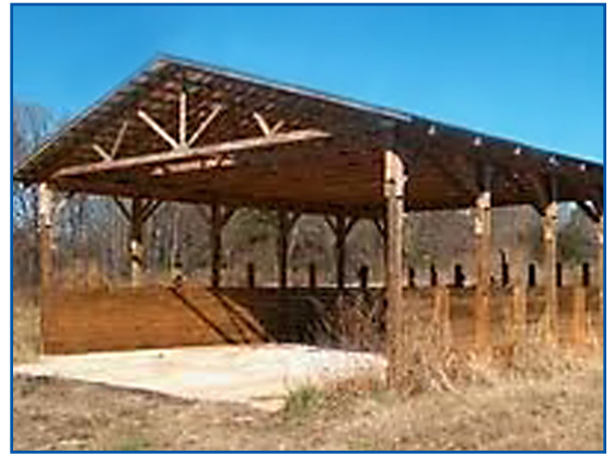
An example of a well-planned bulk-manure storage area.

Operations caring for large animals, such as horses or cattle, may find it necessary to store daily manure collections in a central area, or pile, on the property until the manure can be land-applied or sold. Producers raising smaller livestock, such as sheep, goats, llamas, alpacas, poultry, or rabbits may find they can process these smaller bulk amounts regularly, requiring less storage area on the property. Producers will need to consider their facilities and space available for manure storage. If bulk amounts of manure will be stored on the property, the producer should be sure the pile is located in an area that will be the least bothersome to neighbors and that is on a cement slab with proper drainage to reduce waste runoff in wet weather. If part of a manure-marketing plan includes the need to store manures until sale,