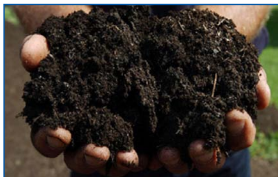
Compost is a nutrient-rich soil amendment.

The combination of heat and addition of other organic materials makes for a safer, more nutrient-rich final product. Once the composting process is complete, the product is ready to be applied directly to the soil.