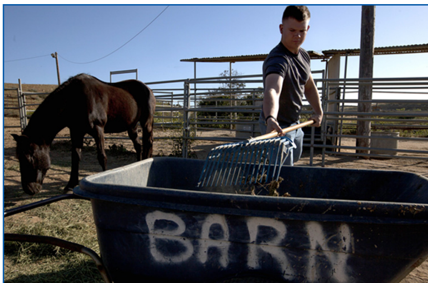
Regularly removing manure from animal pens is an important factor in animal health.

healthy living environment for livestock. Non-composted manure becomes a breeding ground for airborne pests and flies (Nelson, 2008) and manure allowed to build up in pens and pastures will give off a foul odor, increase the presence of parasites in animals, and give the property an unclean, uncared-for feeling. Good manure management also increases a farm's curb appeal and will help foster a good relationship with neighbors who may not appreciate the smell of manure next door. In addition to removing manure from animal pens regularly, you will need to compost or remove the accumulated pile of manure from the property on a regular basis. Although removing the entire manure pile at one time would be an