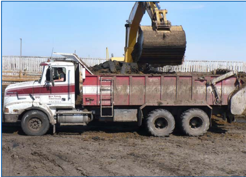
Tractors and trucks are often needed to remove manure in larger operations.