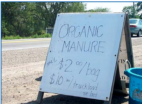
Simple signage helps advertise your product.

On-farm sales are a popular part of the growing agritourism business model. This approach encourages interaction with your customers and allows them to see where the product came from and how it was made. This is a great opportunity to share information with your customers and educate them on the importance of your product as well as promote your business. This option can be as simple as allowing customers to load bulk manure onto trucks or trailers or as fancy as creating a roadside stand or farm store to showcase your products. This option can be used alone or in addition to other agritourism events your farm may offer. Producers should be sure to consider potential liability issues that may arise from customers bringing their vehicles onto the site and using farm tools or equipment.