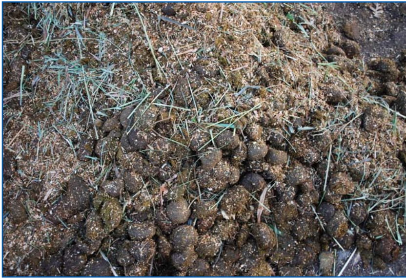
An example of pack manure.