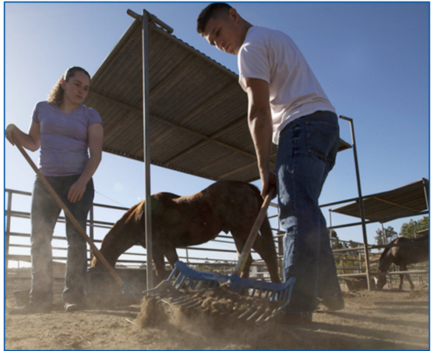
Initial investment can begin with a fork and wheelbarrow.