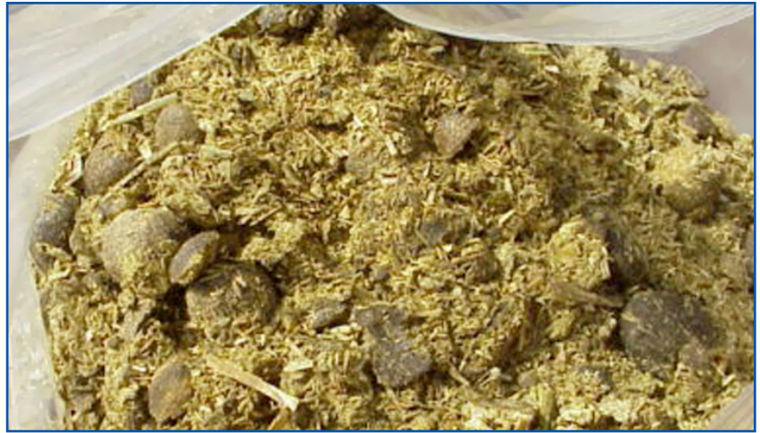
Aged manure is lighter and less odorous than fresh manure.

Aging manure, also known as passive composting, relies on time, natural temperature, moisture fluctuations, and UV (ultraviolet) radiation from the sun to reduce pathogens (Chapman et al., 2013). This aging process is done by exposing manure to the natural elements for an extended period of time, allowing it to dry out. This also allows some of the salts to leach out of manure that, if manure is applied fresh or raw, are likely to burn some plants. During the aging process, the chemical nutrients such as nitrogen, phosphorus, and potassium are used and incorporated into the bodies of the bacteria, fungi, and microbes that use those nutrients as a food source. These convert nutrients to a rich slow-release, organic form that returns them to the soil when the aged manure is land-applied. The manure retains most of its nutrient and nitrogen content, still making