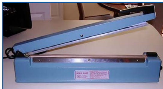
A simple heat-sealing machine.

Like raw and aged manure, composted manure can be picked up in bulk, eliminating the need for any packaging materials, or it can be packaged into smaller, well-sealed bags for resale. Manure that has been composted typically has a non-offensive, earthy scent, making it a good candidate for packaging and resale. If composted manure is being directly marketed as a fertilizer product or as a “plant food,” there are state regulations requiring a fertility analysis of N-P-K on the bagged product being sold.