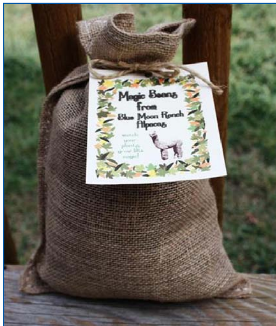
Custom packaging can be simple yet appealing.

it a viable nitrogen source and beneficial soil amendment. The nutrients contained in composted manure are not as quickly available for plant uptake as are those in raw manure or synthetic fertilizers. Growers applying aged manure as part or all of their fertility program will see nutrients become available as the soil temperatures warm over 50°F and microbial activity rapidly makes those organic fractions available.