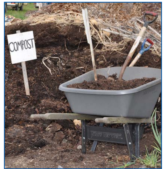
Bulk compost straight from the pile.

For more information on the composting process, see the ATTRA publication Composting: The Basics .