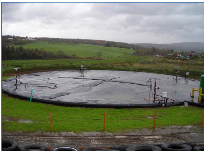
Methane digester on a small farm.

Regular removal of manure from animal pens is a crucial biosecurity practice in maintaining a clean,