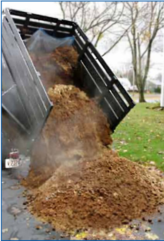
A load of fresh manure.

applications, such as a garden or small vegetable plots, there are no requirements. Many states however, have rules and guidelines for composting larger quantities of manures on-farm. Even farms that have no animals or birds on-site are regulated under the Clean Water Act.