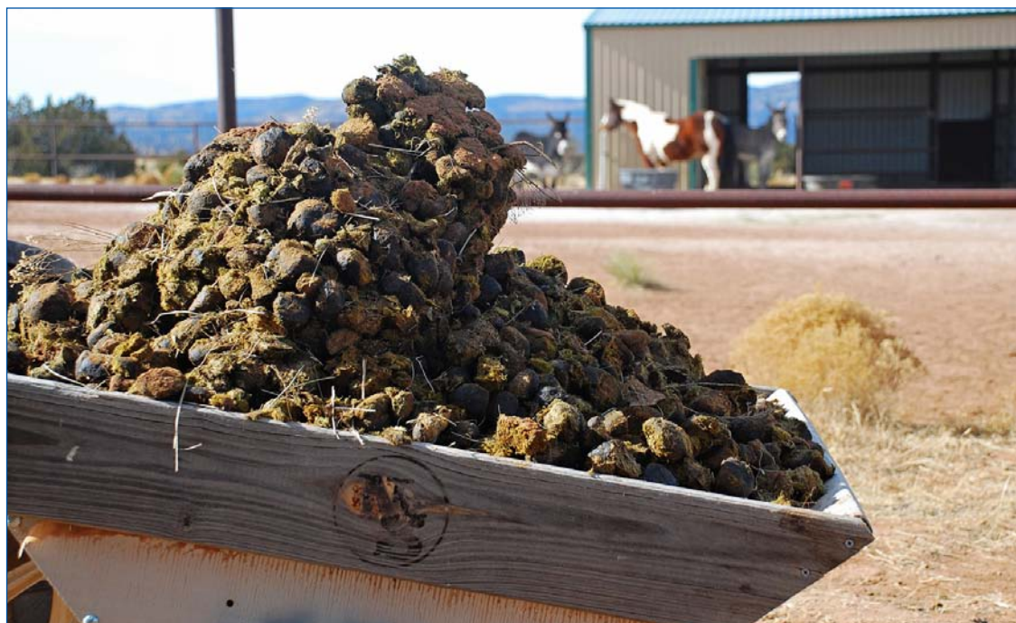
Green gold.