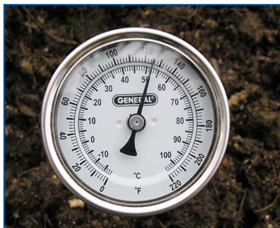
Compost thermometers aid in proper composting.

Composting is a biological process in which microorganisms convert organic materials such as manure, leaves, sawdust, straw, and paper into a soil material called compost (Maryland Horse Outreach Workgroup, 2007). The high temperatures (140 - 160°F) generated through composting can kill many potentially harmful organisms and weed seeds (Barnyards and Backyards, 2007) that may be present in raw manure. When the management goal is to reduce pathogens, the compost shall attain a temperature greater than 130°F for at least five days as an average throughout the compost mass (NRCS, 2007). Producers considering composting manure should be aware that they will need sufficient space for compost piles for the duration of the composting process and should factor in specialized equipment that may be needed in some applications, such as a windrow turner.