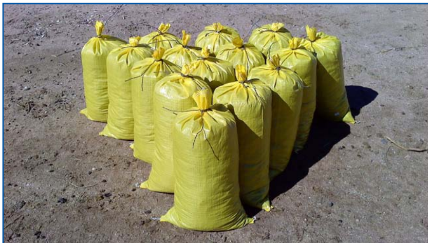
Old feed bags can be used to transport bulk manure short distances.

Raw manure can be used as a nitrogen source for home composting systems. Raw manure can volatilize quickly, causing it to lose fertility value if not mixed with carbon elements or covered.