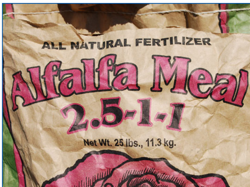
NPK amounts shown on a bag of fertilizer.

Producers who market manure, in any form, are meeting the needs of their clients by providing a product that is sustainable and that has many benefits. By diversifying, or providing a variety of products or processing options, a producer can expand to further meet their clients' needs. This means that as a producer, you should regularly have a supply of your product available to you and once you have established your market and built a strong customer base, you should have a demand for your manure product. Regular communication with customers to address their changing needs and preferences is important. Knowing and understanding your targeted customers is the overarching rule of all exceptional companies (Hall, 2012).