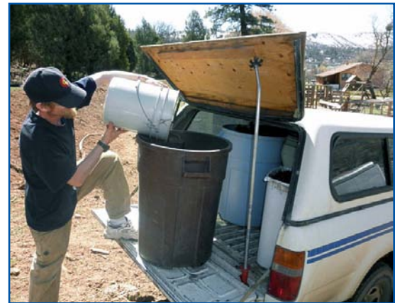
Offering bulk manure allows a customer to take as little or as much as they need.

Raw manure is best suited for on-farm pick up, either loaded by the customer or by the producer. A tractor may be helpful for loading larger quantities. Again, be aware of liability concerns associated with this marketing strategy. Simple, inexpensive signage advertising "manure for sale" works well as a marketing tool.