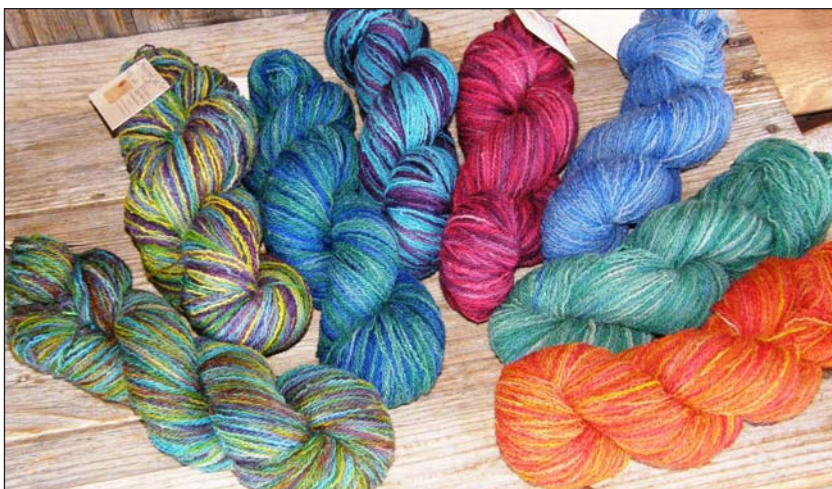
Handpainted Sock Yarn, 80 percent alpaca, 20 percent merino blend.

Llamas are usually shorn annually and have a double-hair coat consisting of a fine wool fiber intermingled with stiff guard hairs. The guard hairs can be left in when making rugs and ropes. But before spinners and weavers can use the 4- to 7-inch-long