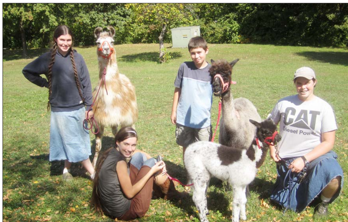
Social animals.

Llamas or alpacas can be a good addition to a farm or ranch—an alternative livestock enterprise on marginal pastureland that fits well into a diversified farming operation. This publication discusses considerations for raising llamas and alpacas, including regulations, marketing, nutrition, care, reproduction, and handling.