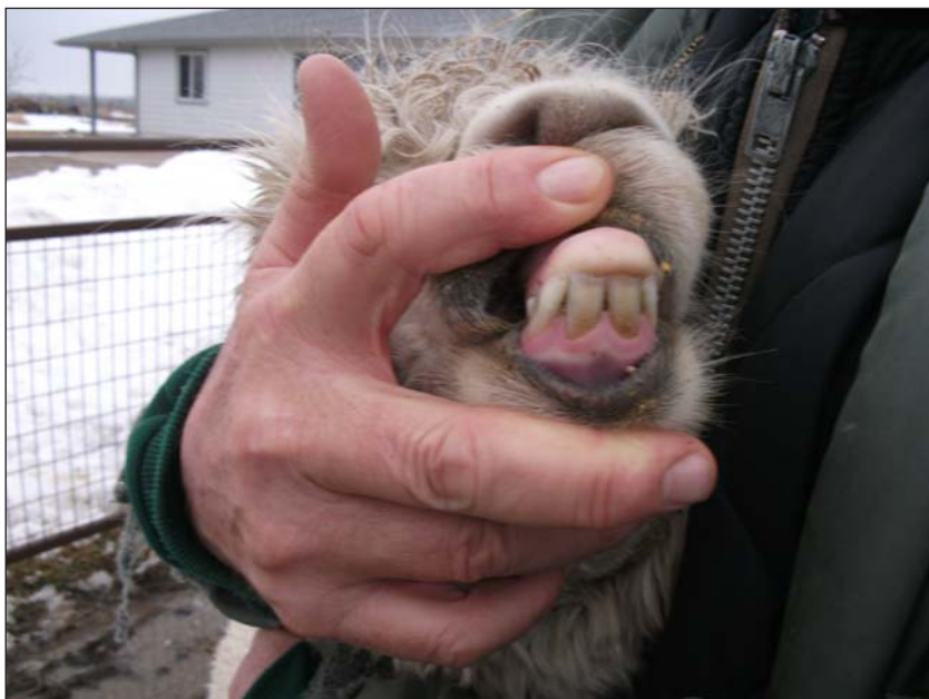
Correct alpaca bite.