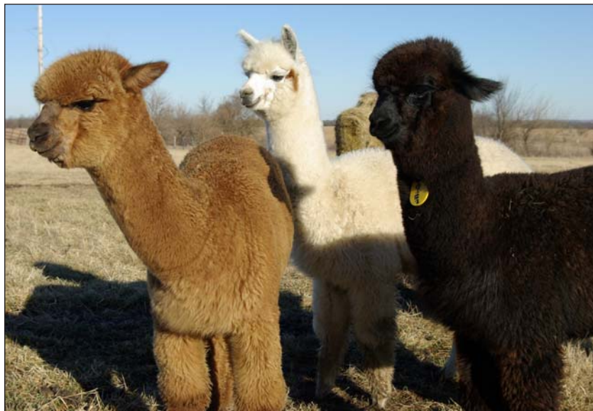
Huacaya alpacas.

Adult alpacas typically weigh between 130 and 200 pounds. Their height at the withers averages 36 inches (Berman, 2011). The alpaca's lifespan is similar to that of a llama, averaging 15 to 25 years. There are 22 natural basic colors of alpacas ranging from black to white—including many different browns, grays, tans, and creams. Alpacas tend to be a single, uniform color, but occasionally will have white markings on the face, neck, or legs.