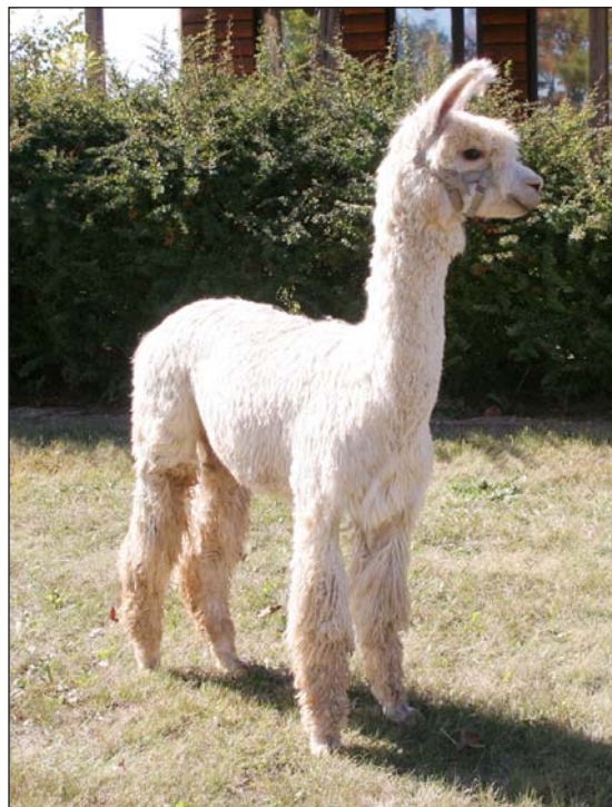
Suri alpaca.

Suri is a less-common variety of alpaca. The fiber of suri alpacas grows parallel to the body and hangs down the sides of the body in curly ringlets. Suri fiber doesn't stand out from the body, but parts along the backbone and hangs along the sides, giving the animal a slender, sleek look (Dey, 1998). Suri alpacas have five defined lock structures. These different types of fiber are listed on the Suri Network website www.surinetwerk.org , along with the suri alpaca breed standard.