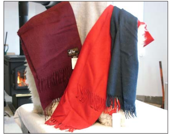
Alpaca scarves.

llama fiber for knitting and weaving other products, the guard hairs have to be removed.