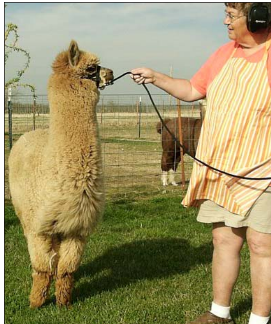
Huacaya alpaca on lead.

Be careful not to leave halters on all the time, and don't tie animals to any stationary object, such as