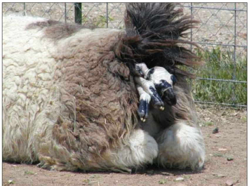
Llama birth.

Baby llamas and alpacas, or crias, weigh 12 to 17 pounds (5.5 to 8 kilograms) and 24 to 35 pounds (11 to 16 kilograms), respectively (Merck & Co. Inc., 2011). Crias should remain with their mother until at least four months of age, though