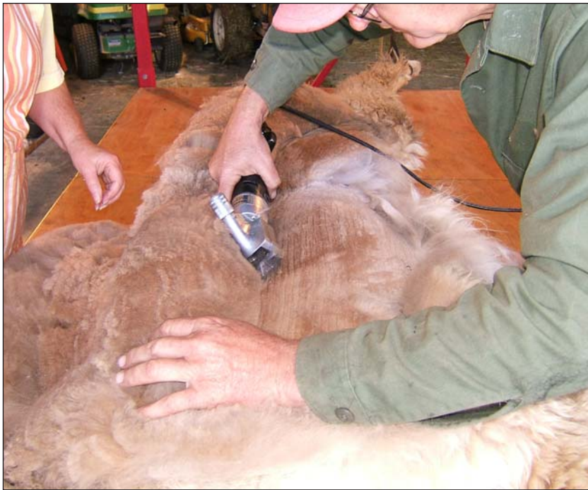
Shearing fiber.

Llamas can include breeding stock, fiber-producing stock, pack animals, cart-pulling animals, golf caddies, companion pets, animals for pet therapy programs for nursing homes and schools, and guardians for alpacas, sheep, or goats. Live-sale uses for alpacas are mainly breeding stock or fiber-producing stock, though they also make good therapy animals.