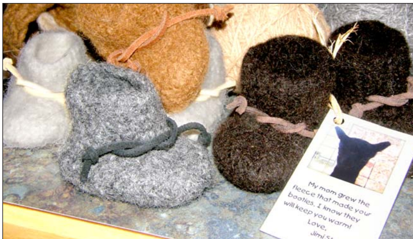
Alpaca booties.

Llamas can also be used as guardians for livestock, including cattle, sheep, and poultry. As a herd animal, the llama is particularly attentive to menaces (Walker, 2003). Llamas are natural guardians due to their inherent wariness of the dog family. An