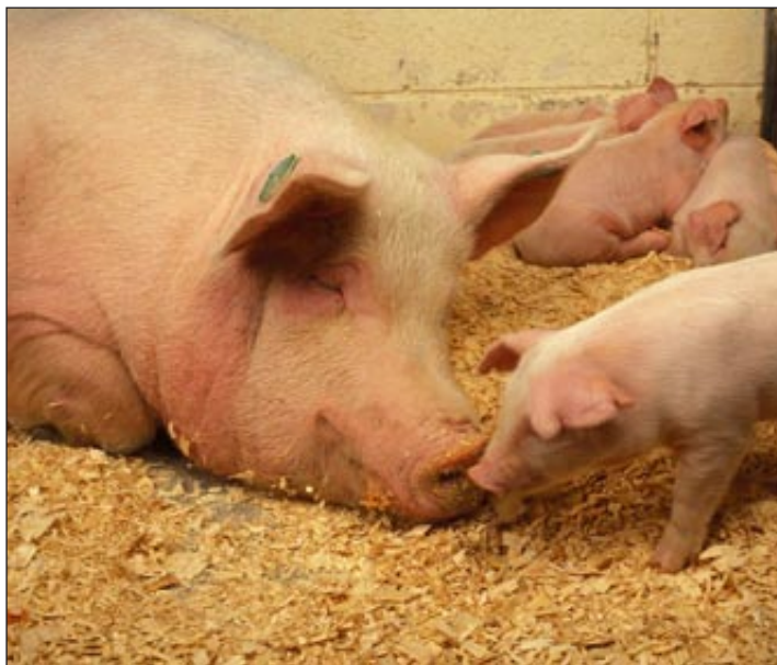
A sow and her piglets.

Designer of livestock handling facilities and an Associate Professor of Animal Science at