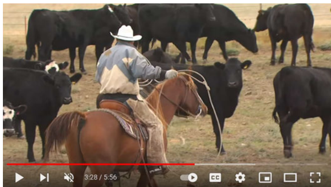
Video stills from Preventing Farmer Suicide: Collaboration and Communication .