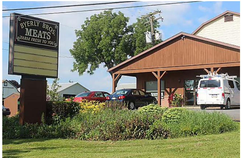
Finding a good processor is an important step in successfully marketing your lambs to the consumer. Processing your lambs at a USDA-inspected facility is necessary to market lamb across state lines.

Ideally, the processor should be relatively close to your farm. This limits the stress of hauling, allows you to easily view the hanging carcasses, and eases your transportation costs. Often, we