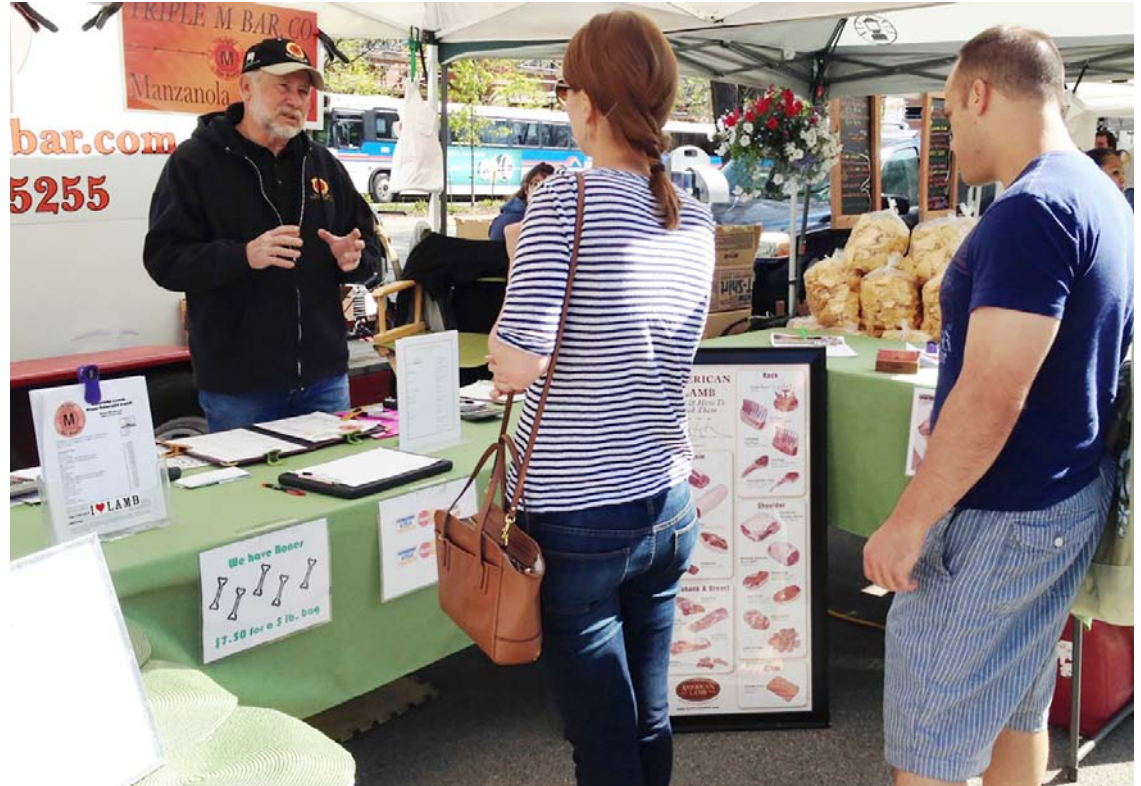
Direct marketing offers economic opportunity that cannot be found in the sale barn.