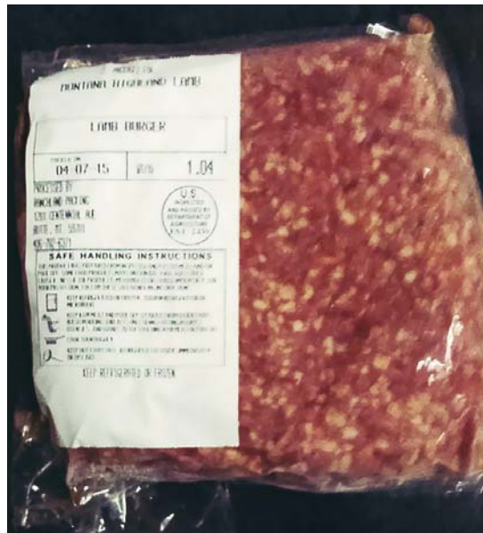
A package of lamburger displaying about 85/15 meat-to-fat ratio and attractive color. Perception and appearance drive customer sales.

Another example in which the skill of the butcher translates to economic gain for the lamb producer is in processing the trim into grind. Trim is the meat trimmings removed from all of the primary cuts that are not suitable to be included therein. Any excess fat needs to be removed from the trim in order to make a quality grind. This excess fat is a small but notable amount. Too much fat will produce ground lamb that will likely be rejected by the consumer, especially when it is packaged in clear packaging. It is best to shoot for a ground product that is 85% meat and 15% fat. Ideally, the trim should be ground at 32°F to 34°F in order to be packaged as a crisp, engaging product. Additionally, grind must be frozen quickly. Anything that slows the freezing process (excessive stacking of the packages in freezer, or too-slow freezing, for example) can result in discoloration of the meat. Ground lamb that is attractively presented in its package is one of the best-selling of all lamb cuts.