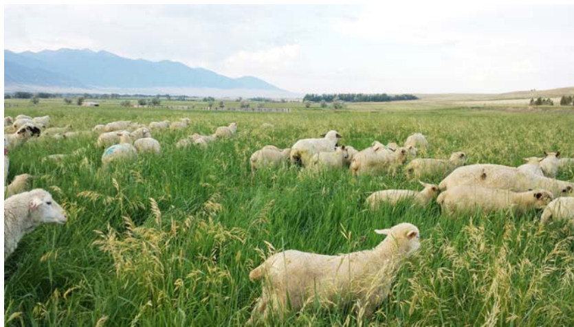
Today's food-conscious customer wishes to tie her table to your farm. Encourage it!

Once you have a potential customer's attention, differentiate your lamb from that of your competitors. Start big in scope and narrow down. It's easy for a customer to grasp that lamb produced in Australia and shipped on a boat 11,000 miles is not going to be as fresh as your lamb that is raised locally. Describe how your lambs freely roam on green pasture for most of their life, and this, along with the genetics in your flock, is what produces such mild-tasting meat. Tell how you finish your lambs, letting customers know that you have a proven system for producing that delicious product they just sampled. Mention that your lamb is antibiotic, hormone, and GMO-free. If it is certified organic, stress that. Detail how you go through all of your lambs weekly and select out those that are finished (see the ATTRA video Putting a Hand on Them – How to Tell When Your Lamb is Finished ) and ready to be processed. Reinforce that it is just not possible for a big feedlot to do that and explain that while these efforts increase the price somewhat, it is worth it. Then encourage them to buy your lamb and experience the difference in quality themselves.