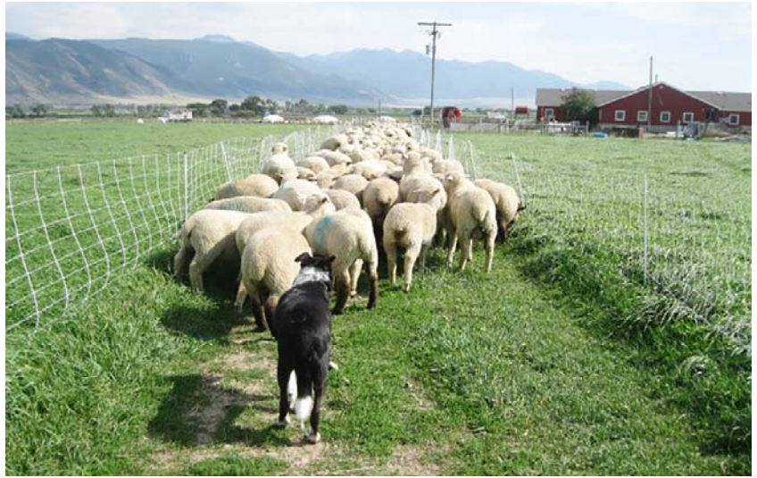
Direct marketing: you can do it.

The most important factor in marketing any food product is the quality of the product itself. A lamb producer-entrepreneur must learn how to raise, finish, and process his lamb to the degree that the finished product unquestionably demands the attention of the consumer. The lamb product