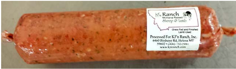
This lamb herb sausage by KJ'n Ranch in Helena, Montana, is packed in a roll, or chub package.

your meat, keep in mind the three objectives of packaging: presentation, functional integrity of the package, and retailer acceptance.