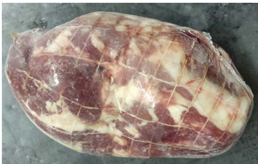
A nicely processed boneless half-shoulder roast, double-wrapped in plastic wrap and then Cryopak. Note the tight seal and the absence of air pockets.

Beyond that, there are two methods: vacuum pack and Cryopak. Both have their advantages