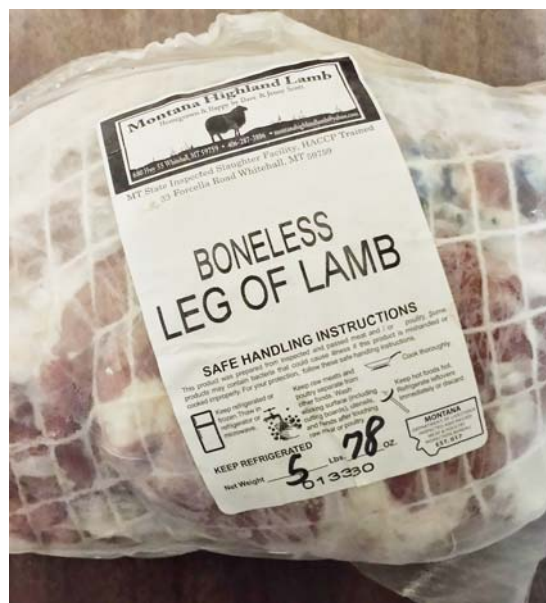
You can have your logo on the standard cut label or you can use the plant's cut label and an additional brand logo.