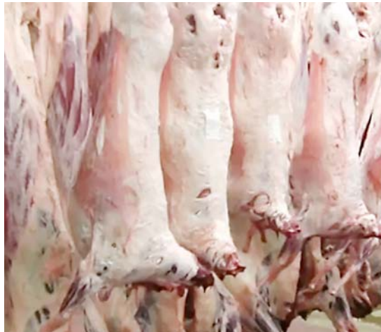
A group of lamb carcasses being dry aged. Dry aging tenderizes and intensifies the flavor of the lamb.

I n general, dry aging lamb for seven days optimizes tenderness and flavor while minimizing weight loss from the carcass.