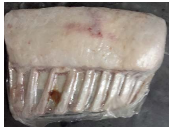
A nicely prepared rack of lamb.

Conversely, racks with too much finish must be trimmed, resulting in more labor from the