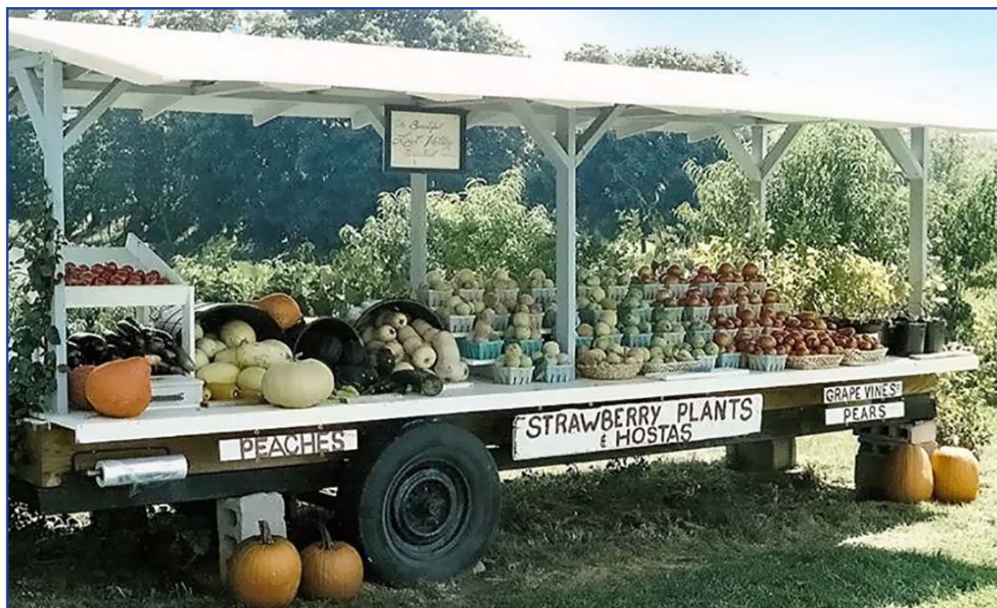
Farmers market display.

This publication discusses direct marketing and the benefits and risks associated with selling agricultural products directly to customers. Popular direct marketing strategies covered in this publication include farmers markets, Community Supported Agriculture (CSA), and direct sales to restaurants, institutions, and food hubs, as well as agritourism and Internet-based direct marketing. Additionally, the publication contains information on marketing plans, pricing strategies, and creative marketing techniques. Examples illustrate how farmers are utilizing direct marketing channels to become more economically viable.