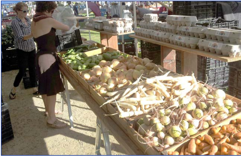
Farmers market.