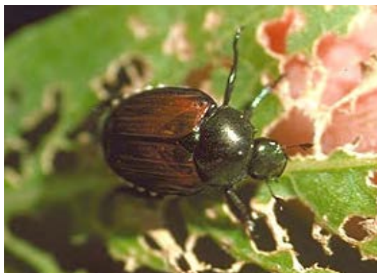
Japanese beetle skeletonizing a leaf.

Organic growers use a number of methods to control these pests. Hand picking, trapping, milky spore disease, and/or beneficial nematodes have all been used by growers with varying degrees of success. The key practices are the use of milky spore (which provides a long-term approach to larvae reduction), trapping away from the crop, and regular emptying of the traps.