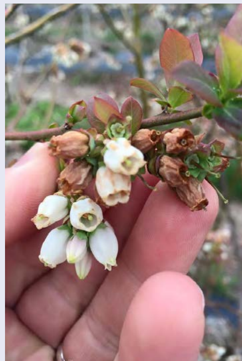
Freeze-damaged blueberry flowers. The white flowers are undamaged.

Floating row covers can help keep tender blossoms a little warmer but can’t be expected to protect much past a couple of degrees below freezing. Being able to overhead irrigate can protect down to 22°F. This frost threat is probably a common enough occurrence now that growers should strongly consider budgeting a frost-protection system from the outset.