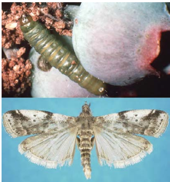
Cranberry fruitworm larva (top). Cranberry fruitworm moth (bottom).

A Michigan study reports that many parasites attack the cranberry fruitworm. The most common larval parasitoid is Campoletis patsuiketorum (Hymenoptera: Ichneumonidae); the most common parasitoid recovered from the fruitworm's hibernating structure was Villa lateralis (Diptera: Bombyliidae) (Murray et al., 1996). Therefore, maintaining refugia by enhancing field borders for beneficial insects and practicing proper sanitation are especially important in controlling this pest. Additionally, eliminating weeds and vegetative litter around plants helps cut down on overwintering protection for fruitworm cocoons.