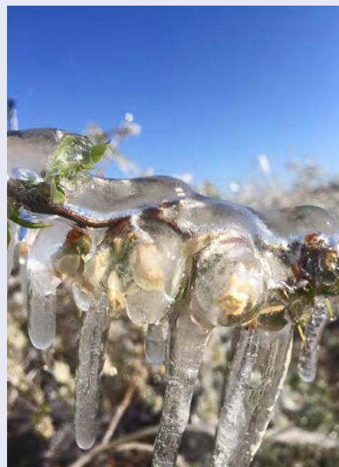
Blueberry flowers under a protective layer of ice provided by overhead sprinklers.