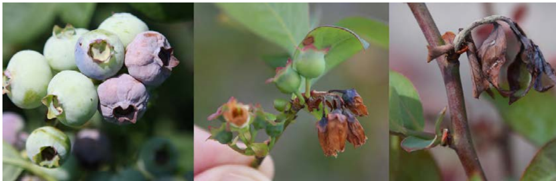
Mummy berry (left). Mummy berry with apothecia (center). Infected leaves and flower bud (right).

Stem blight shows up as a wilting, browning, or reddening of the infected leaves, which frequently