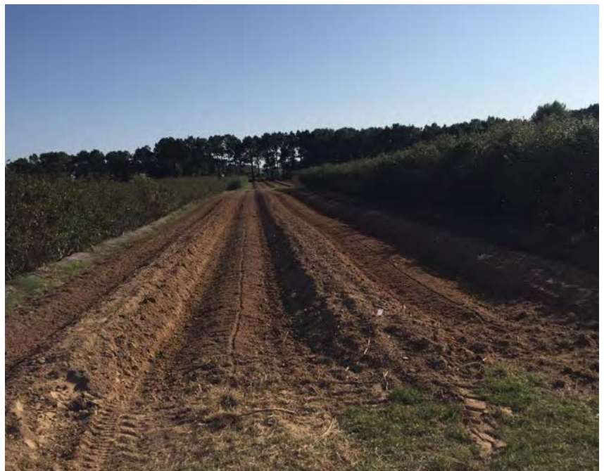
Shaping raised beds in preparation for planting.

One other characteristic of the blueberry, peculiar to its natural environment, is that the crucial plant