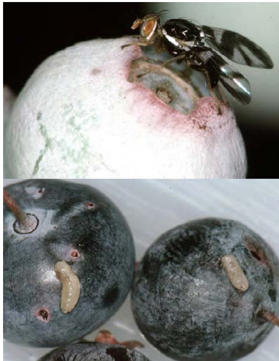
Blueberry maggots on fruit (adult fly, top; maggots, bottom).

The choice of blueberry varieties can influence the severity of blueberry maggot damage. In a Rhode Island study, the early-ripening varieties Earliblue and Bluetta were found to have fewer maggots than late-maturing varieties whose ripening periods were synchronized with the fly's egg-laying period. Of the mid- to late-season