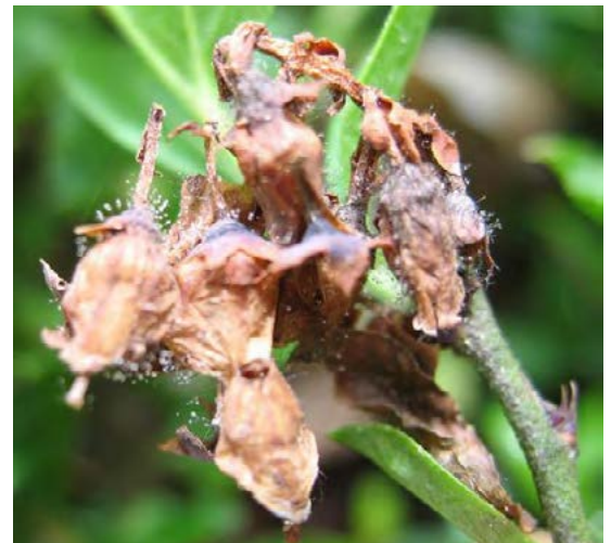
Botrytis Blight-infected flower clusters.

Managing soil health is key for successful control of soil-borne diseases. A soil with adequate organic matter can house large numbers of organisms (e.g., beneficial bacteria, fungi, amoebas, nematodes, protozoa, arthropods, and earthworms) that, in conjunction, deter pathogenic fungi, bacteria, nematodes, and arthropods from attacking plants. These beneficial organisms also help foster a healthy plant that is able to resist pest attack. For more information, see the ATTRA publication Sustainable Management of Soil-borne Plant Diseases .