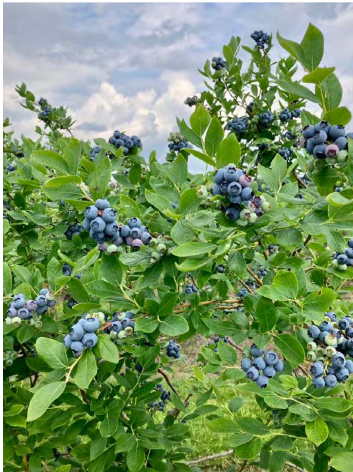
Blueberries ready for harvest.

Although anyone may choose to grow organically, the USDA National Organic Program (NOP) regulates the labeling, marketing, and record-keeping procedures of all products labeled as organic. If you have a commercial farm and plan to market your produce as organic, you will need to be certified, unless your gross farm income is less than $5,000.