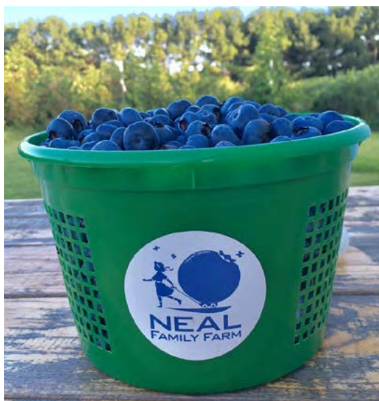
A clever and memorable logo on all its merchandise enhances a farm's sales in the community.

A lthough highbush blueberries are grown for both fresh fruit and processing markets, more than half of the cultivated blueberries grown in the United States are sold as fresh blueberries. Because returns to the grower usually are higher for fresh berries, most organic growers choose that option.