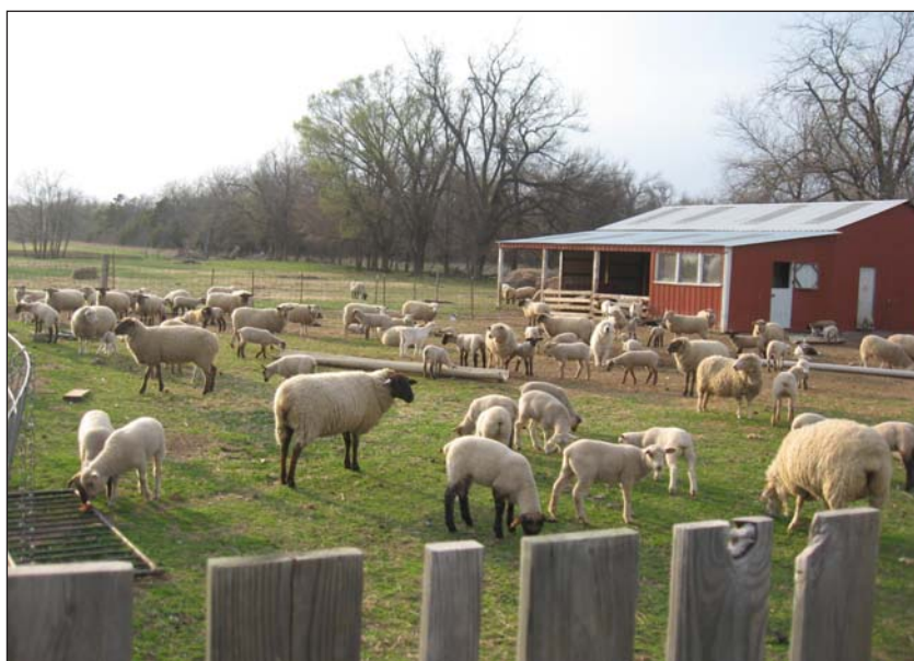
Keeping records and selecting animals with the ability to fight off parasites is the best long-term strategy for managing internal parasites.

It may seem that selecting for resistance to internal parasites involves a lot of extra work. Researchers admit that it will take a lot of time to make significant progress so that a flock will be relatively free of clinical disease even under challenge. Internal parasites have many advantages in this game, including the ability to wait for the right time to become active again and infect animals or to actively breed and lay eggs so that eggs will be deposited during a favorable time of the year. Parasites are prolific and can cause enormous problems to the host in a relatively short period of time.