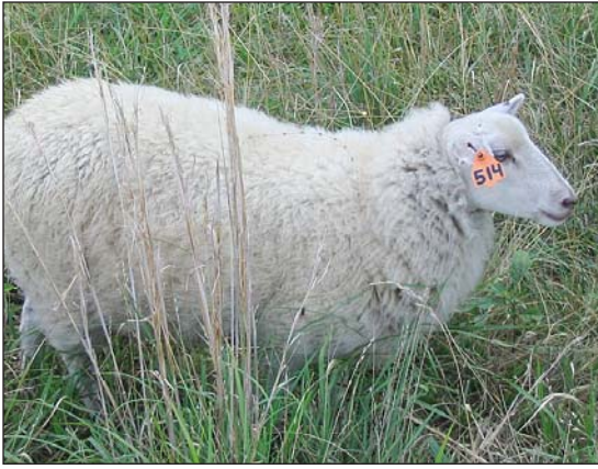
Gulf Coast Native sheep are resistant to internal parasites.

rams yields the F2 generation.) See, for example, the work of J. E. Miller, who experimented with Suffolk (susceptible) and Gulf Coast Native (resistant) sheep (Miller et al., 2006). During that experiment, he found in one infection period FEC in the F2 sheep ranging from 167-149,933 eggs per gram. An article that includes a table listing resistant breeds of sheep is available at www.aces.edu/pubs/docs/U/UNP-0006 .