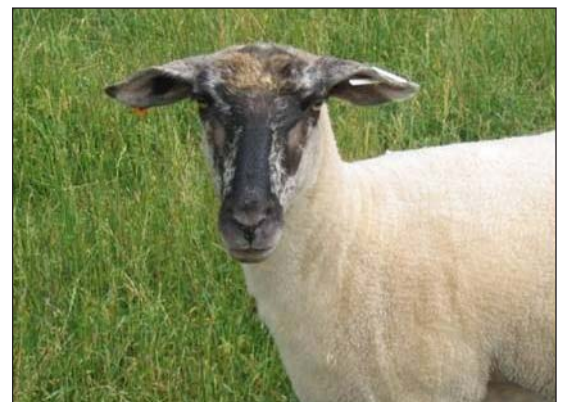
This lamb is the F1 generation from Gulf Coast and Suffolk parents.

Still, it is useful to know which breeds have shown parasite resistance. Incorporating one of those breeds may have almost immediate impact on internal parasite problems and will have long-term benefits. Again, the farm goals and production traits of importance must be kept in mind. Also, when using a resistant breed for crossbreeding, there will be a lot of variability in the F1 and F2 generation. (Crossing two breeds results in the F1 generation; crossing the F1 ewes with F1