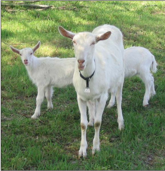
This yearling dairy doe is nursing twins and may have a higher fecal egg count than an older or dry doe.