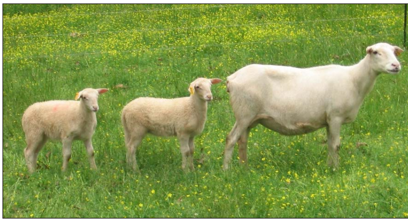
Katahdin ewe and lambs.

However, there are many factors that affect fecal egg counts besides the susceptibility of the animal. These include the level of exposure (challenge), stage of production of the animals (young or lactating animals may shed more eggs), and the type of forage being grazed (consuming high-tannin forage such as sericea lespedeza causes fecal egg counts to drop dramatically). Supplementation or otherwise providing better nutrition has been shown to lower FEC (Kahn et al., 2003; Eady et al., 2003) and reduce anemia (Burke et al., 2004). Also, the parasites themselves account for some variation. Some parasites (such as Haemonchus contortus ) are very prolific and will produce a lot of eggs. Other species may not; for those, a lower egg count may still mean a serious internal parasite infection. Also, internal parasites don't lay eggs continuously and so eggs are not evenly distributed in feces. If you sample an animal twice, you will find some variation in fecal egg count even on the same day. And the number of adult worms inside the animal may not be well correlated with the fecal egg count (Saddiqi et al., 2010); immature adults and older worms produce less and males produce none.