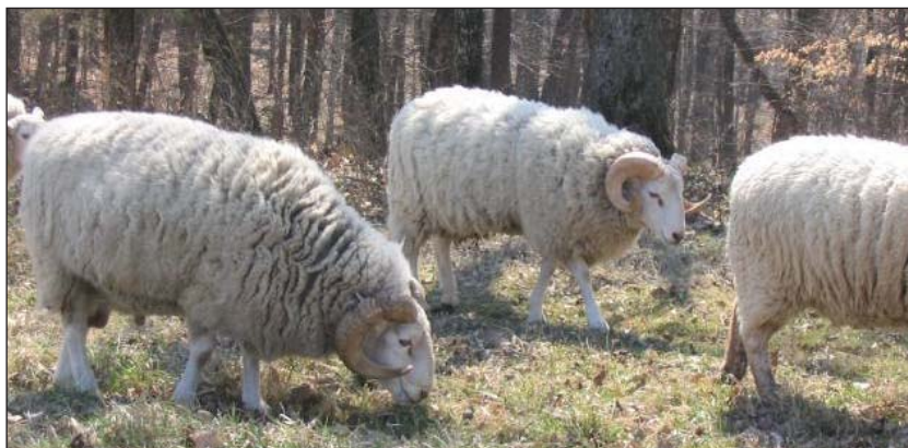
Rams and bucks have a large impact on the parasite status of the farm. These Gulf Coast rams have never needed deworming.

R esearch has shown that internal parasites are not evenly distributed in a herd or flock.