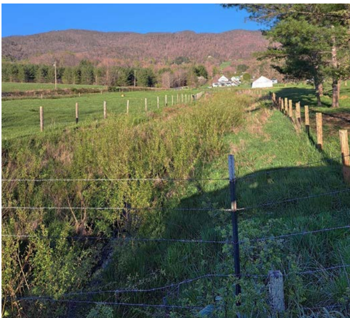
Fenced riparian area in livestock field.