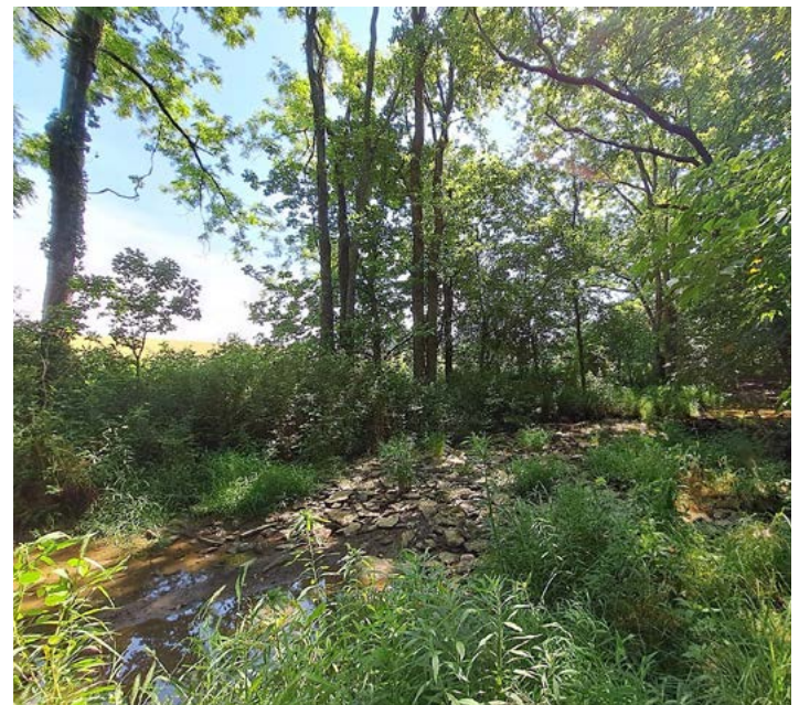
Native riparian species in restored riparian area.