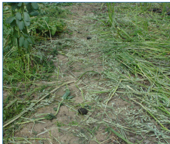
Sheep manure in a cover cropped walnut alley. This farmer stopped grazing sheep in their walnut orchard due to the potential risk (and liability) of contamination by pathogens from undecomposed manure contacting walnuts during harvest.