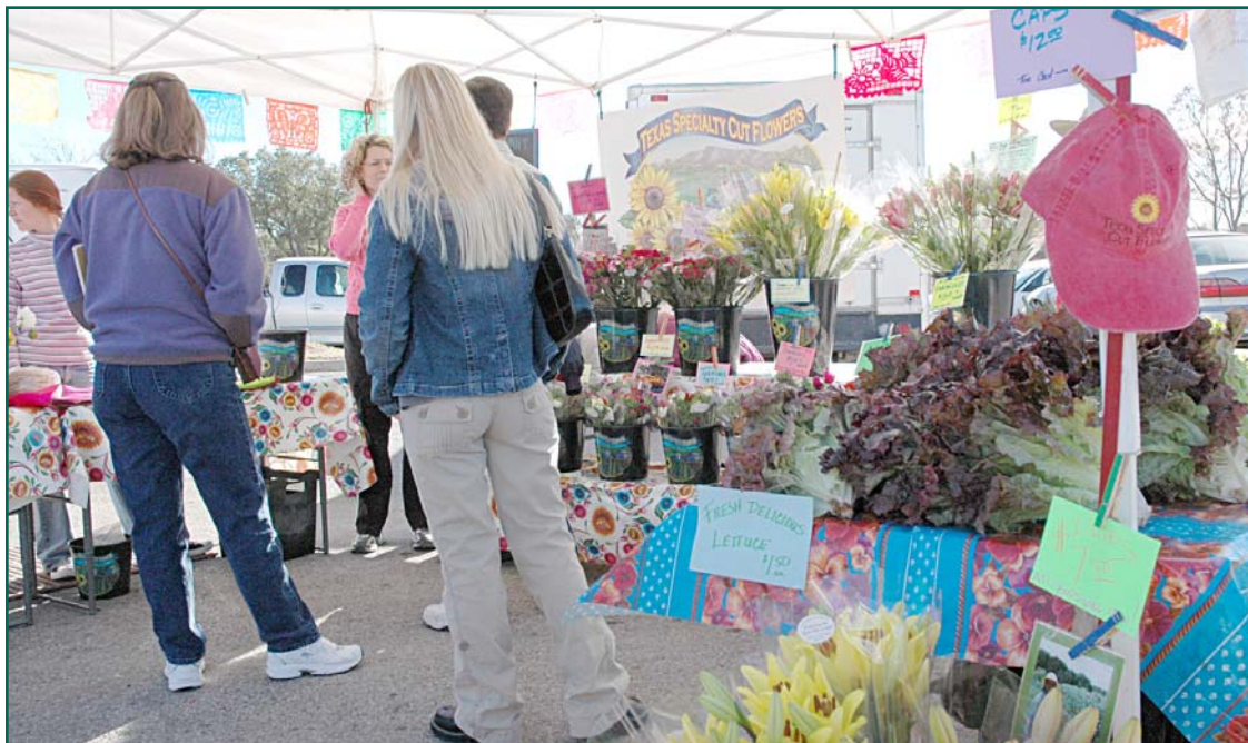
Pop-up tents offer shade for farmers at an Austin, Texas market.

From USDA Agricultural Marketing Service, www.ams.usda.gov