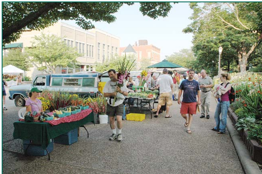
A beautiful location is an advantage.