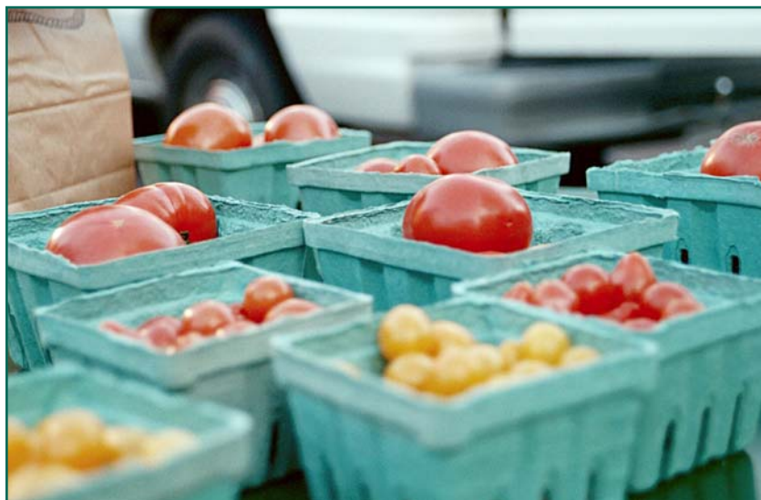
“SalsaFest” tomatoes at the Fayetteville, AR, Farmers Market. Everyone is happy when local tomatoes ripen.