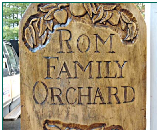
An artistic hand-crafted sign identifies this vendor's spot.