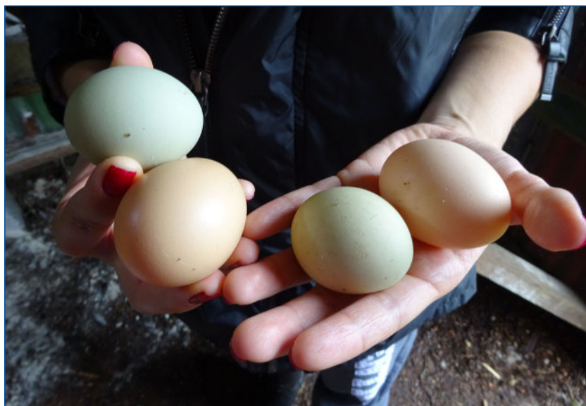
Freshly gathered eggs. Eggshell colors are characteristic of different breeds of laying hens.

In order to sell eggs as organic, they must be handled in certified organic handling facilities and using allowed materials. Materials commonly used in egg handling include cleaners, sanitizers, and egg-coating materials. These are listed in §205.605(a) and (b) with any restrictions on their use as sanitizers (e.g. chlorine materials, hydrogen peroxide, peracetic or peroxyacetic acid); defoaming agents (ingredients must be organic or on the National List, e.g., silicon dioxide, organic vegetable oil), and egg coatings (organic oils). As noted above, any material planned for use must be listed in your OSP and approved by your certifier for its intended use. In addition to being allowed under NOP organic regulations, egg handling methods and materials must meet federal regulations: USDA Grading Standards (Agricultural Marketing Service or AMS); Egg Products Inspection Act or EPIA, Egg Safety Rule, and Food Code (Food and Drug Administration); the National Poultry Improvement Act (Animal and Plant Health Inspection Service or APHIS); Flock Health & Production, Research, Statistical Information (from the Food Safety and Inspection Service or FSIS, Agricultural Research Service or ARS, and National Agricultural Statistics Service or NASS). They must also meet state and local requirements as applicable, such as regulations of State Departments of Agriculture, Departments of Health Services, Industry Marketing Boards, and Farmers Market Boards, as well as Retail Food Codes.