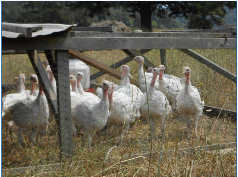
Turkeys on pasture.