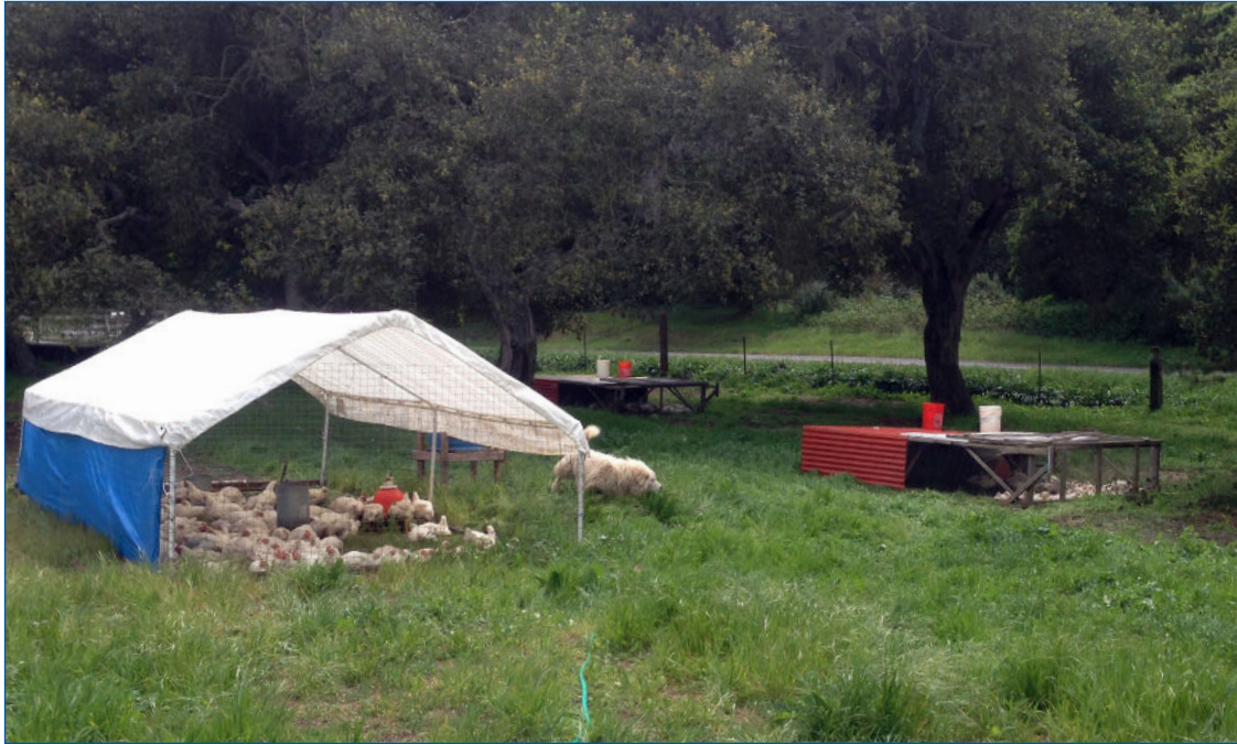
Cornish Cross broilers shown in two styles of moveable pens on Fiesta Farm.

https://attra.ncat.org/espanol/ganado.html#aves