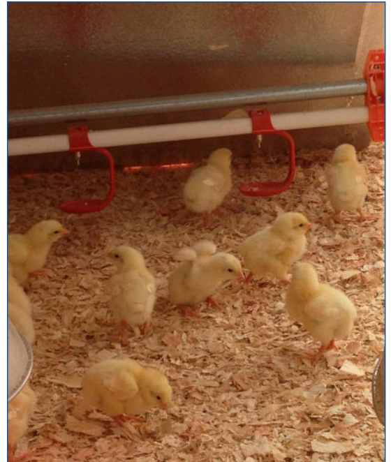
A clean environment for young birds, along with selection of well-adapted poultry breeds, are foundations of preventative health care for organic poultry.

Although pasture is not required for organic poultry, outdoor access is required. Production systems that allow poultry to forage fulfill the requirement for outdoor access and can provide for healthy living conditions. Pasture-based systems can be certified organic when they use organic feed, preventative health care, and avoid prohibited materials. House-based systems are also permitted for organic production, provided they allow for access to the outdoors and direct sunlight, and otherwise fulfill all other regulatory requirements described below in Living Conditions.