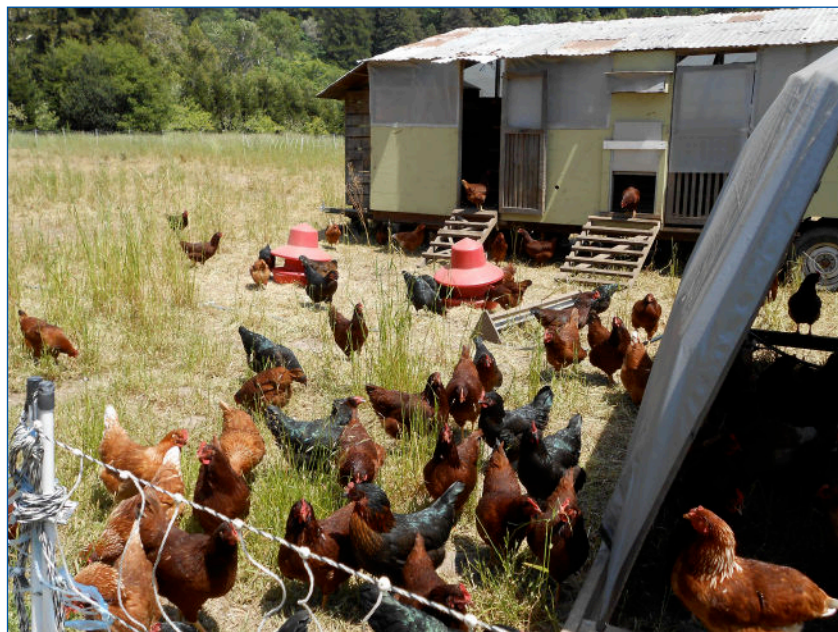
Living conditions required by organic regulations include access to the outdoors, shade, shelter, exercise areas, fresh air, clean water for drinking, and direct sunlight, as shown at Everett Family Farm.

Chicks, poults, and other young birds are typically confined during brooding to keep them warm and safe from predators. Outdoor access is required for all poultry once they have adequate feathering. Confinement of poultry after this stage of development—about four weeks for chickens—must be documented and justified according to the reasons for temporary confinement allowed in §205.239: inclement weather; stage of life; health, safety, or well-being; risk to soil or water quality; healthcare—illness or injury; sorting, shipping or sale; breeding; and youth projects.