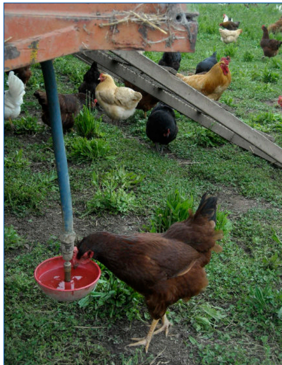
Laying hens on pasture with clean water, Solseeker Farm at Hain Ranch Organics.

Organic regulations require preventative health care, beginning with appropriate selection of species and breeds, an overall healthy environment with good sanitation and biosecurity measures to prevent the spread of diseases, and measures to minimize stress. Vaccination against prevalent diseases of poultry is allowed in organic poultry production, as long as the vaccines are not genetically modified. Vaccines commonly used in the United States include those for Marek's disease, Newcastle disease, and infectious bronchitis. Preventative practices and healthy living conditions, such as maintaining clean feeding and watering systems, are critical to reducing diseases such as Coccidiosis, which is caused by a protozoan parasite. Probiotics, or beneficial microbes, may be fed or added to drinking water to establish beneficial microflora. These work in the poultry's gut, through competitive exclusion, to reduce pathogenic organisms such as Salmonella and E. coli .