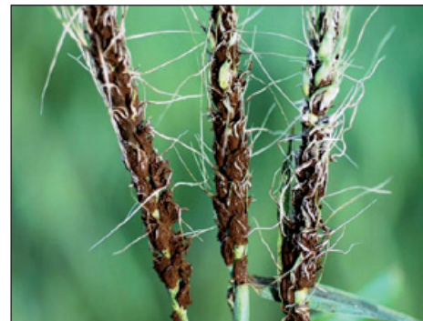
Loose Smut on wheat.

The consolation is that this disease will not destroy an entire crop. A 15% yield loss would be considered unusually high for this disease, with 1% to 2% yield loss more common. Likewise, loose smut has little impact on end-use quality. If this disease appears, however,