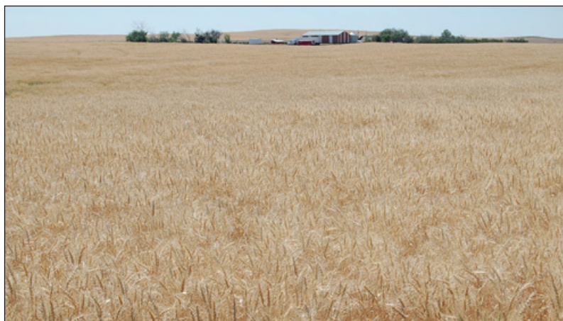
Organic winter wheat at the Quinn Farm, Big Sandy, MT.

The second tier in the hierarchy is mechanical and physical methods that may include introduction of natural predators, natural traps, and repellents, and development of habitat for natural enemies.