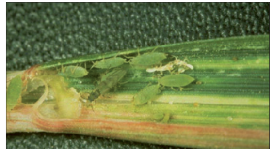
Russian Wheat Aphid.

Another major in-crop insect pest for small grains is the Russian wheat aphid (RWA). The Russian wheat aphid affects grain by injecting a toxin that damages the plant, typically resulting in a white stripe running down the leaf blade. Several resistant varieties have been developed and are used extensively in Colorado, Kansas, and Texas, where warm temperatures allow for greater RWA survival. Most grain in Montana and North Dakota does not have this resistance. These states escape serious aphid infestation because their cold northern climates delay aphid migration, although climate change may affect this. University of California IPM Pest Management Guidelines point out, “Wheat and barley are the most susceptible; rye and triticale, while susceptible, are usually less damaged; and oats appear to sustain little or no injury. Russian wheat aphid does not attack corn, sorghum, or rice” (Summers et al., 2009). A diverse crop rotation can help minimize Russian wheat aphid damage across an entire farm.