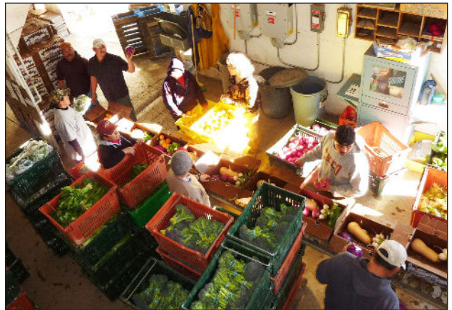
Packing CSA boxes, Full Belly Farm, Guinda, Calif.