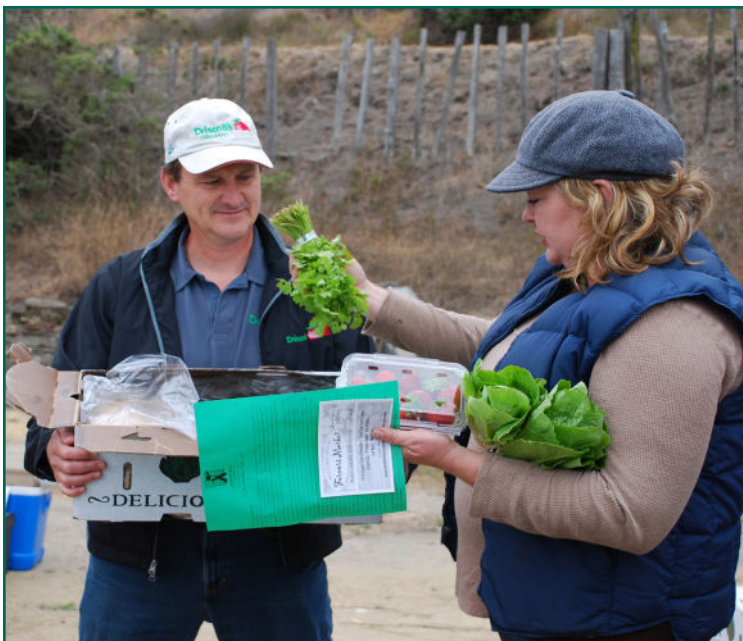
Serendipity Farm.