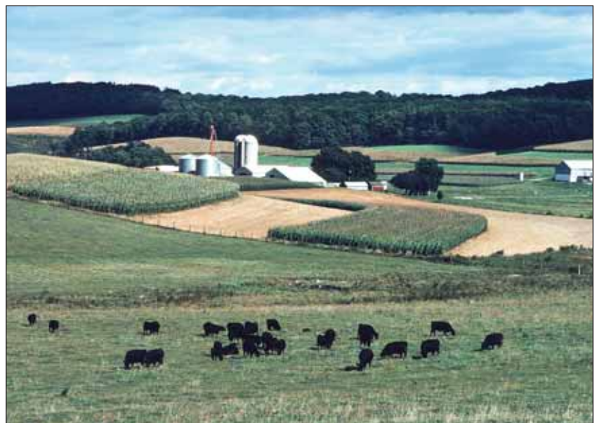
Cattle combine well with mixed cropping, as on this diversified farm in Maryland.

Cattle have the potential to give value to cover crops in rotation when the crop otherwise might not yield an economic return (Bender, 1998). Many farmers utilize legume cover crops in rotation to build soil and increase soil nitrogen for subsequent crops. Cover crops greatly