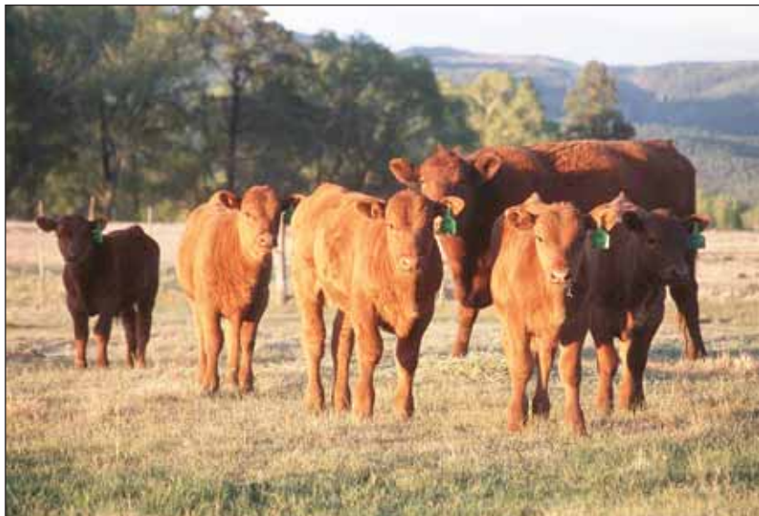
Red Angus cattle grazing on a rotational grazing system in Rio Arriba County, New Mexico.

The three most important traits to select for are adaptability , fertility , and longevity . These three