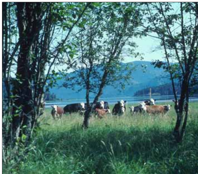
Grass-based cattle production is inherently resilient because of reliance on renewable pasture resources.

Visit John Hopkins's Forks Farm Market online at www.forksfarmmarket.com .