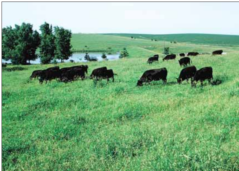
Cattle grazing on cool-season pasture in Ida County, Iowa.

Supplementation is not necessary in a well-managed grass-finishing production system. Rather than relying on grain for energy supplementation, graziers can take advantage of forage-sequencing systems and diverse forages that include multiple species of grasses, forbs,