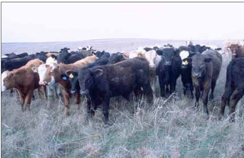
Stocker cattle under an intensive grazing system in Oklahoma.

When manure applications are combined with nutrients from the dead leaves and roots of pasture plants, the nitrogen contribution to nutrient cycling can approach 280 pounds per acre each year in a moderately managed grass-and-clover pasture (Bellows, 2001). Pastures with a legume component of 20% to 45% are more sustainable than monoculture grass pastures because the legumes contribute significantly to nitrogen fertility. For more information, see ATTRA's Nutrient Cycling in Pastures .