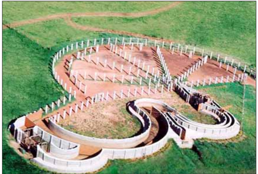
Curved races facilitate the movement of cattle through the cattle handling facility.

According to Grandin, round pens or corrals were used for gathering herd animals more than 11,000 years ago in the Middle East. Grandin's research in animal-handling-facility design has