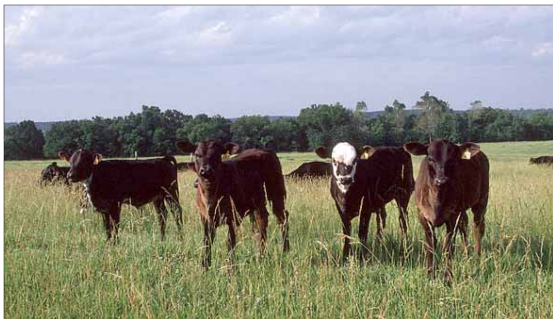
Beef calves on fescue pasture in Missouri.

Market demand is rapidly increasing for sustainably raised and organic beef products. Pasture-based or grass-based livestock production relies on biodiversity and ecological complexity to maintain production with the use of less costly inputs. Cattle producers recognize that grazing and pasture access can lower production costs, reduce animal stress, and boost the animal's immune system. This publication highlights the practices producers are using to provide customers with nutritious food from pasture- and rangeland-based farms and ranches. Resources are included for further reading.