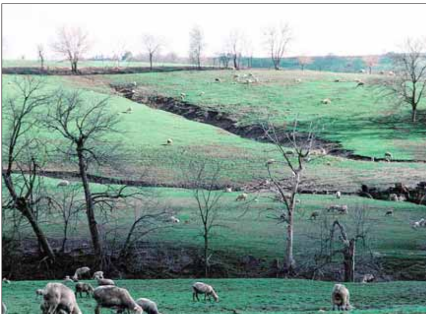
Overgrazing results in low forage and animal productivity and sustainability.