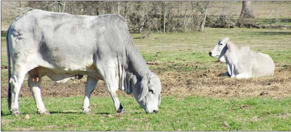
Brahman cows in College Station, Texas.