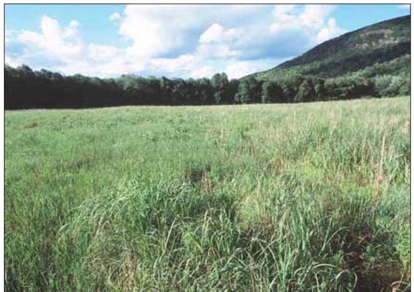
Warm season grassland in Litchfield County, Connecticut.

Soil fertility is the first thing to consider in establishing or maintaining productive pastures. Phosphorus, potassium, and calcium levels, as well as soil pH, are important for pasture-sward quality, quantity, and persistence. Having the soil tested prior to establishing pasture, as