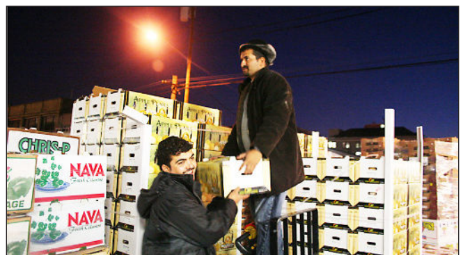
Photo: Loading docks at a terminal market