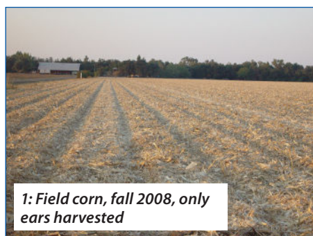
1: Field corn, fall 2008, only ears harvested