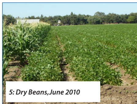
5: Dry Beans, June 2010

This organic farmer uses a very diverse rotation, which supports weed and insect control, and soil health. The rotation will vary depending on prices and water availability. Included in this rotation in subsequent years are alfalfa (3 years).