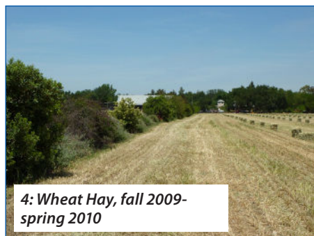
4: Wheat Hay, fall 2009-spring 2010