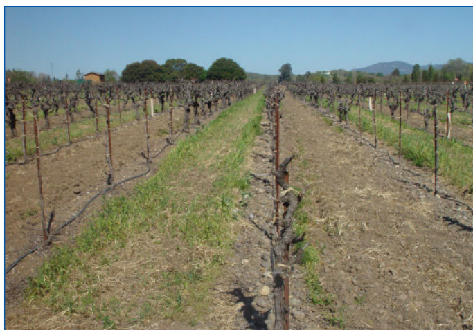
This farmer annually rotates disked the alleys in the vineyard. This technique allows for machinery to enter the vineyard on the cover-cropped alleys, while addressing the risk of frost due to too much cover crop in the alleys.

Clearly, crop rotation will not be applicable to perennial systems. However, rotating cover crops in the alleys between perennial crops represents an opportunity to increase the biodiversity of perennial systems and protect against pest buildups. There are several options related to alley cover crops: they can be rotated annually to a different cover crop, or mix of cover crops, or every other alley can be planted to cover crops, leaving alternate alleys bare. Some farmers believe this practice can provide some level of frost protection because bare ground will absorb and give off more heat. Also, some farmers will plant different cover crops every other alley and each year “switch” the alley cover crops.