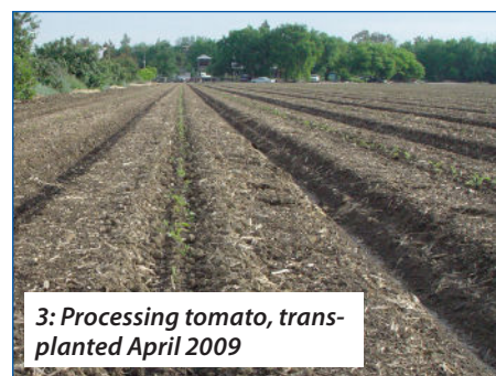
3: Processing tomato, transplanted April 2009