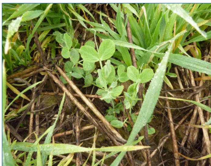
The rolled covercrop on the left will provide seed as well as mulch for the next cover crop, pictured emerging from the mulch on the right.