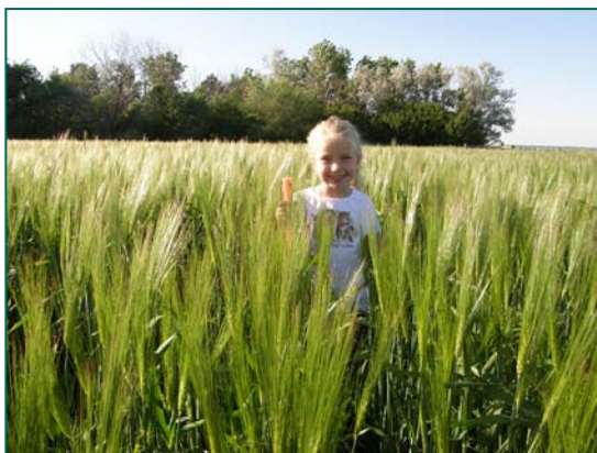
Barley from South Field 2008.