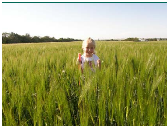
Barley from North Field 2008.

No-Till Case Study, Brown's Ranch: Improving Soil Health Improves the Bottom Line