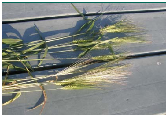
Barley from South Field (top) and North Field (bottom).

make way for an early August planting of a cover crop cocktail on both fields. The moisture content of the grain was about 20%, so he finished the drying with a bin drying system. He did end up blending the barley from the North Field and the South Field so that the entire crop would meet the malt barley contract specifications. Without the blending, the North Field barley would not have met the specifications.