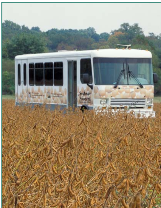
Biodiesel bus.

Biodiesel is currently available in most states that produce oilseed crops, and many farmers use biodiesel as a means of fostering production and raising public awareness. Nonetheless, farmers' access to biodiesel for farm use is another dimension that requires consideration and raises potential for a sad irony. Farmers who raise crops for biodiesel in isolated rural areas may not have ready access to the finished fuel. Unless farmers intend to make biodiesel on-location, or a larger-scale local biodiesel production facility is online, many farmers may find they cannot use the fuel they are working to create. On its Web site, the National Biodiesel Board lists about 1,400 suppliers across the United States, but some have discontinued biodiesel distribution. Almost every state has at least one pump station that offers some blend of biodiesel, though not necessarily within practical distance for most potential customers. The site posts a map of retail outlets for biodiesel across the country. The board recommends asking regional fuel distributors to get more biodiesel supplied locally (NBB, 2009).