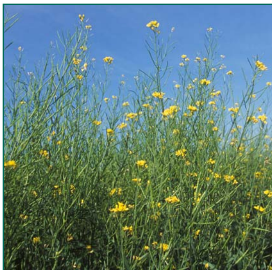
Mustard has rotational benefits.

Waste vegetable oil can be used to make biodiesel. What was once considered a waste product to be given away or disposed of in a landfill now has value and a price for reuse in a many communities. This has the net effect of driving up this biodiesel feedstock cost as well.