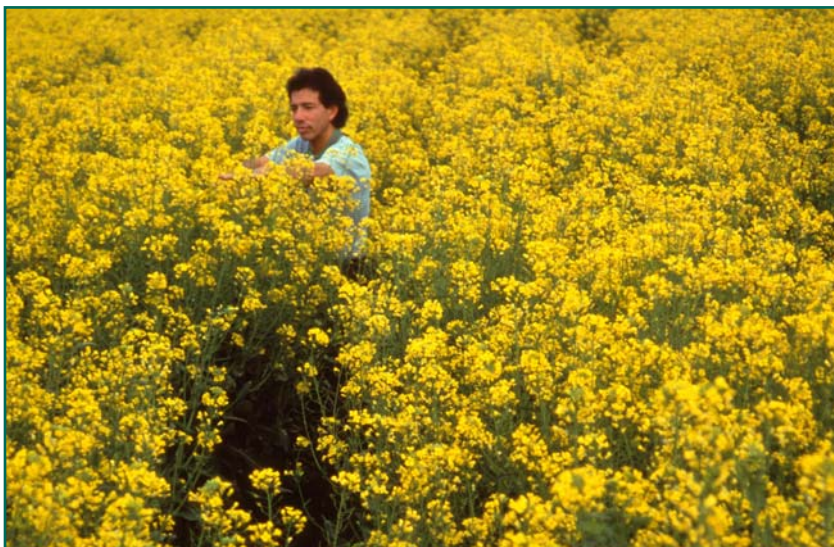
Canola is the edible version of rapeseed.

Commercial-scale biodiesel production has been through some dizzying and difficult growth and retrenchment periods in the past few years. After rapid growth and reports of profits in 2006-2007, 2008 spikes in commodity prices and the collapse in petroleum prices have made for some hard les-