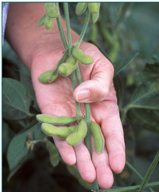
Soybean oil is a common virgin feedstock for biodiesel.

The quantity of biodiesel that can be produced from crops is also limited. If rapeseed were grown on every acre of cropland available in the United States in 2002, an estimated 36.3 billion gallons of oil could be produced — fairly close to current national demand (Peterson). But it is not practical to use all available farmland to produce transportation fuels. Moreover, very serious ethical issues are raised by sacrificing croplands for vehicle fuel in a world where people are hungry and populations are growing. For a discussion of the food versus fuel controversy, see the Web site www.journeytoforever.org .