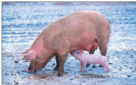
Sow with piglet.