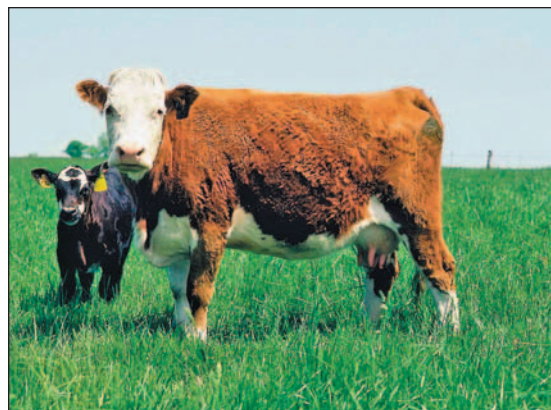
Cow and calf.

Anaerobic digesters are installed for various reasons—as a means to resolve environmental problems, as a means to economically re-use an otherwise wasted resource, and as a source of additional revenue. All of these factors typically play a role in an owner’s decision to install a system.