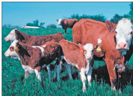
Cows and calves.