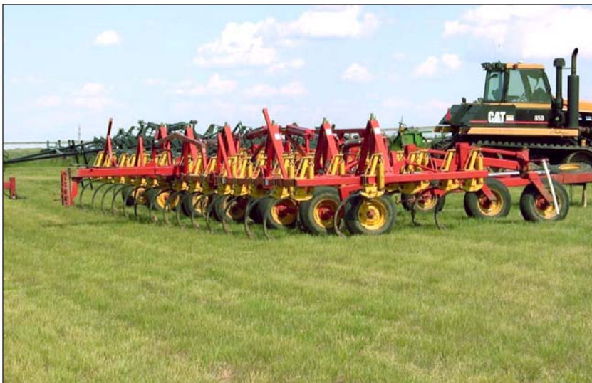
Chisel plow.

One of the more interesting cultural practices for weed control is to provide ecological refuges within or on the edge of fields. These refuges provide habitat for the small mammals and insects that eat weed seeds. Predation rates are extremely high near field edges that maintain good cover for mice, carabid beetles, and other predators (Maxwell, 2010).