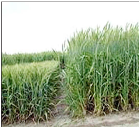
Variety selection helps with weed control.

Variety selection is an important cultural practice for weed management. Certain varieties