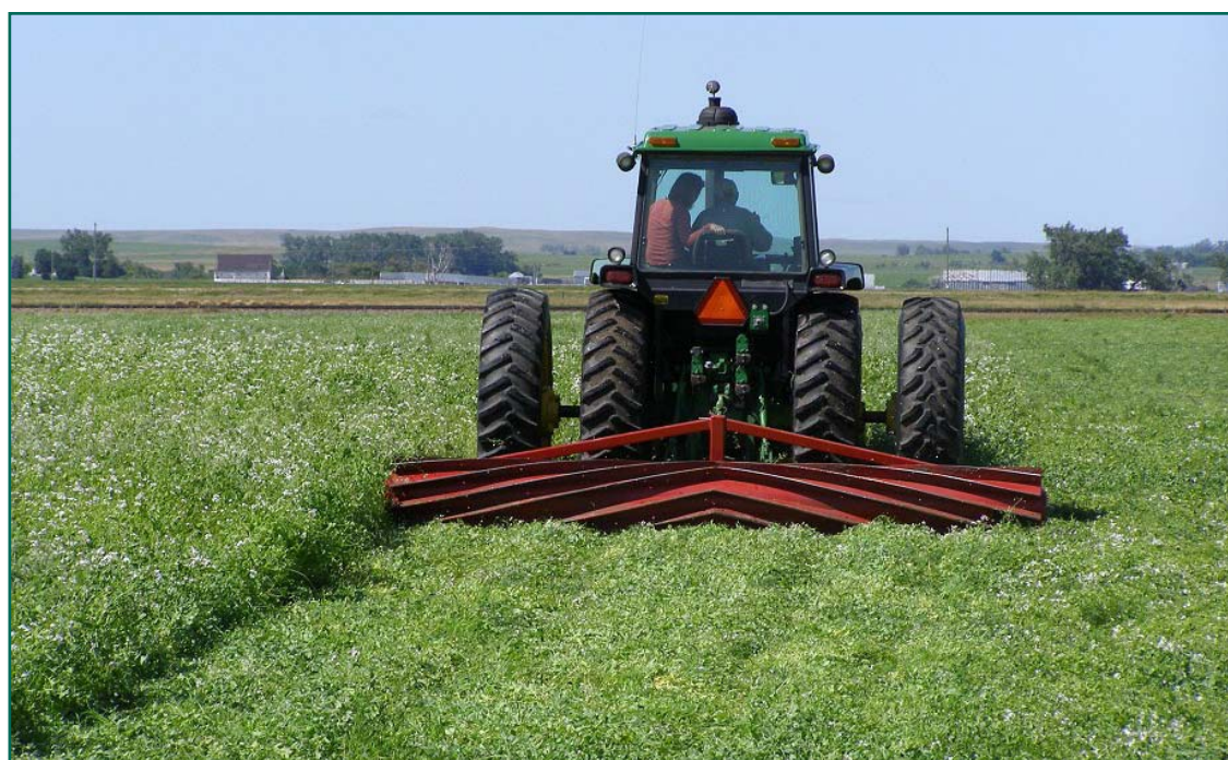
Rolling pea to provide armor.

This publication introduces the multifaceted, comprehensive strategy of weed management used for organic small grain production, combining techniques including crop rotation, sanitation, cultural practices, variety and seed selection and planting, cover crops, tillage, use of organic herbicides, and others.