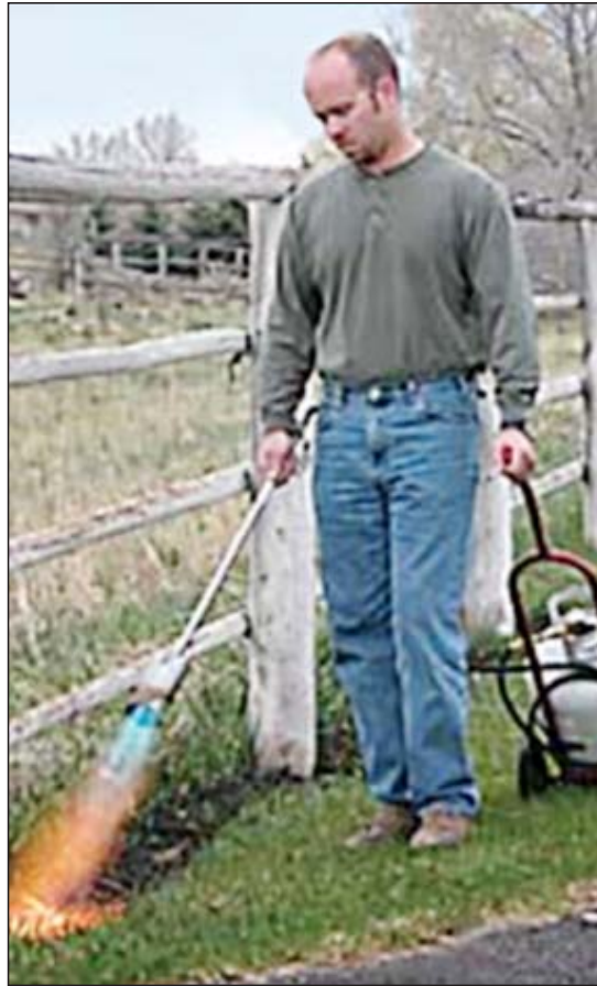
Using a hand-held propane torch.

Flame Engineering in LaCrosse, Kansas, sells hand-held Red Dragon propane flaming systems. 888-388-6724 www.flameengineering.com