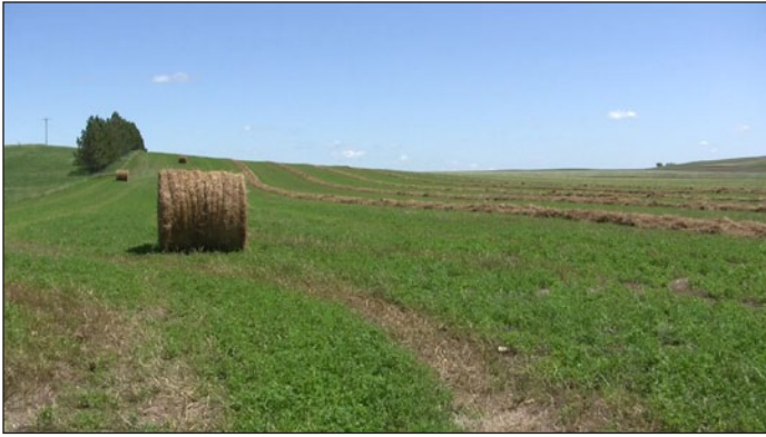
The Boehms' hay field.

While the cattle are not certified organic, they are managed under conditions that allow them to be marketed as “Natural” or “Grass Fed.” They can also sell under the Certified Angus label, since the cattle are a cross between Angus and Black Simmental. Feeder cattle and culled cows are sold at the auction yard in Dickinson at an average weight of 1,200 pounds. Bred cattle are sold directly to other livestock producers.