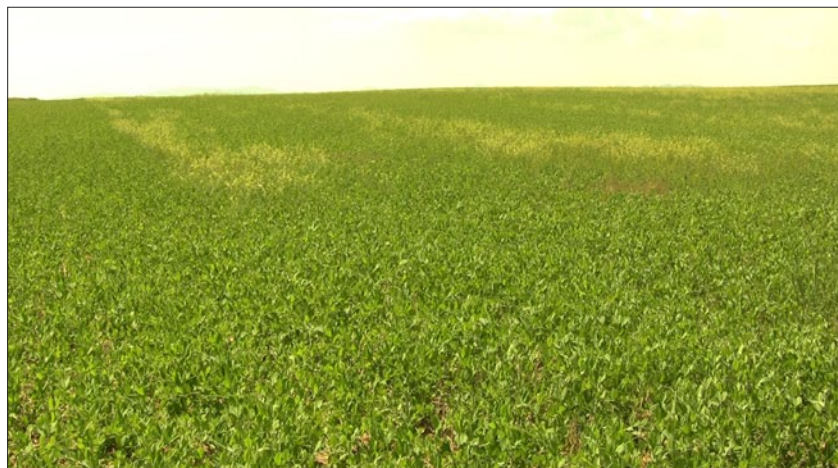
Spring peas with an extra tillage pass on the edge.

In one field of spring peas, he managed to make an extra tillage pass at the edge of the field before seeding. In the photo at left, you can see the difference this made in weed control. The tilled area has no tansy mustard, while the untilled