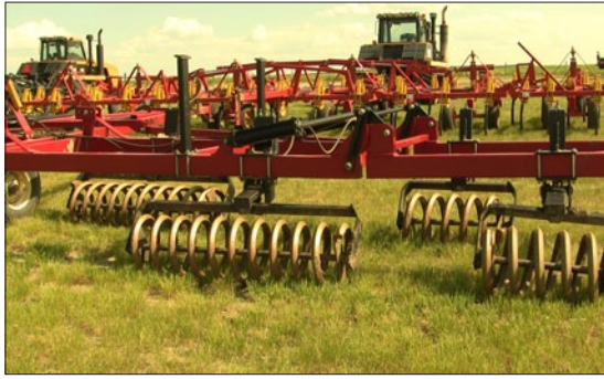
Toolbar with coilpackers.

portion has a noticeable amount. While tansy mustard and lambsquarter are common weeds on Randy's farm, they don't really concern him because they can be controlled well with tillage.