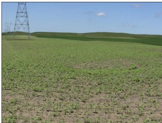
Field of organic buckwheat, Boehm Farm.