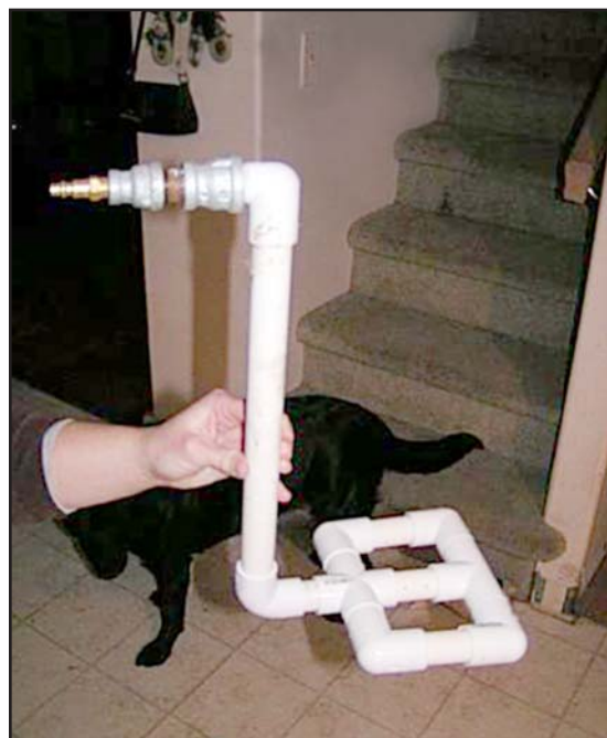
This is a homemade unit to clean eggs with water and bubbles. The unit is made with three-quarter-inch PVC pipe and drilled with a 3/32-inch bit.

Producer Mike Geubert described how to make a similar system on the farm. This can save on costs, especially if one already owns an air compressor. The bubbler system can be made with PVC piping with holes drilled throughout the base and an air coupler to connect to the compressor. The regulator on the compressor can be used to adjust the pressure to 10 to 5 pounds per