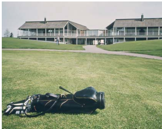
Golf course subdivisions, popular in the 1960s, were built around a clubhouse and golfing greens.

Unlike the thousands of golf-course developments in the nation, where homes are built around a central golf course and club house, an agrihood is built around a working farm, with much of the land preserved for growing food or set aside in conservation easements.