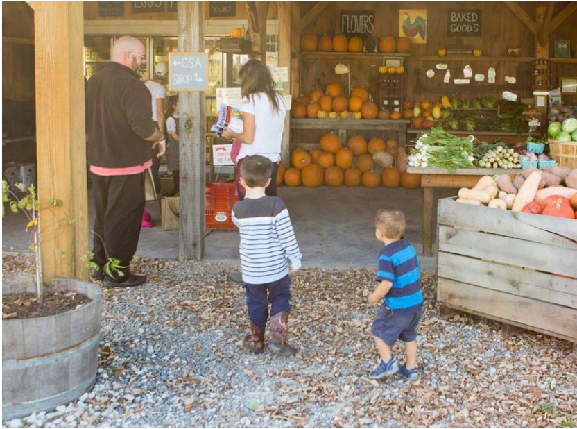
Agrihood farmers markets help encourage healthy lifestyles.

While a traditional rural development often has only one home for every 10 or even 20 acres, an agrihood typically has a much denser housing component, which can keep a much larger portion of land in agriculture or green space than an unplanned subdivision might use. And new agricultural preservation policies at the city and county level are becoming increasingly common across the United States. These new zoning approaches can help direct developers to preserve open land and farm operations in agrihoods.