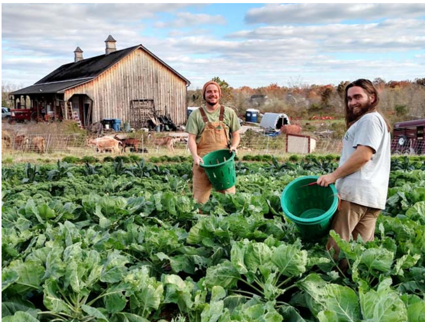
Farmers harvesting vegetables at Willowsford Farm.