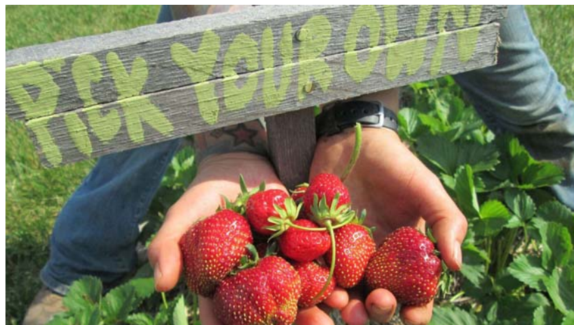
Access to local fruits and vegetables is one of the advantages of development-supported agriculture.

While the seemingly sudden appearance of agrihoods over the past decade across may seem to be just the latest development trend, it may in fact represent a revolutionary and permanent change in new home subdivision design. Daron Joffe, a farm-centered development consultant offered this observation: “We should have farms integrated into our communities in perpetuity—that’s sustainability. That’s keeping people connected to place, to food, to land, and each other. It’s just a good idea.” (McColl, 2015)