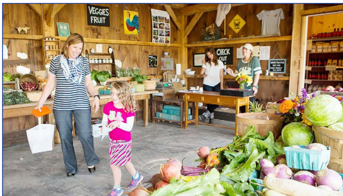
Farmers Market at Willowsford Farms.