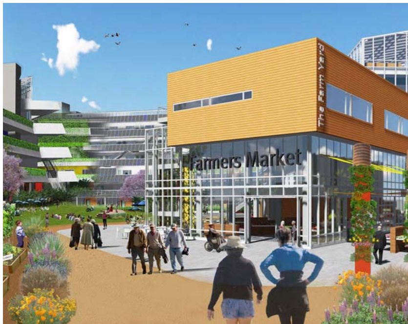
The Win6 agrihood in downtown Santa Clara, California, will feature low-income housing.

Sustainable design will be used in all residential homes built in the Cannery, including solar photovoltaic systems on the rooftops, tankless water heaters, energy-efficient design, and aging-in-place features for senior citizens. Home buyers can also choose to increase the energy features in the homes to achieve a net-zero-energy status, requiring no net energy to heat, cool, and light the home. A commerce district and town center is planned for retail and small business office space (McGrath, 2015).