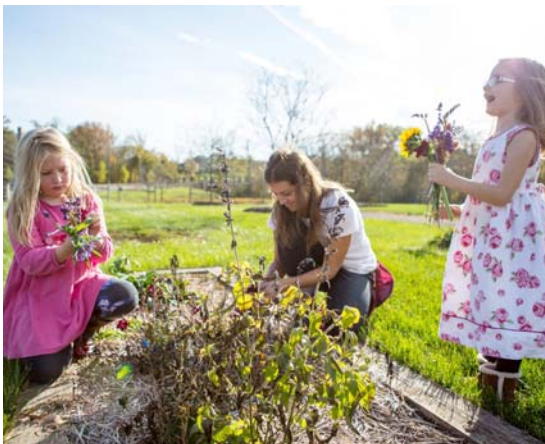
Agrihood families value connecting to the land.