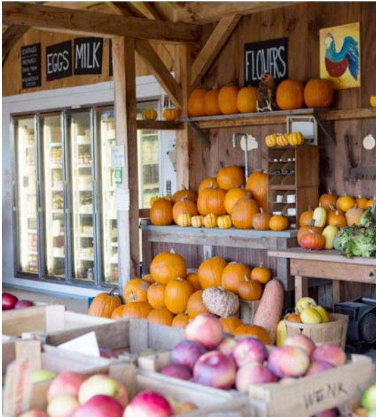
Farmers market at Willowsford Farms.