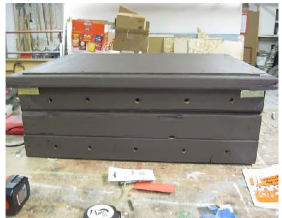
The completed worm bin.

the house. Some experts recommend wooden vermicompost bins because they are more absorbent, better insulated, and provide better air flow (Dickerson, 2001). But it certainly is possible to build successful plastic bins, and many people do.