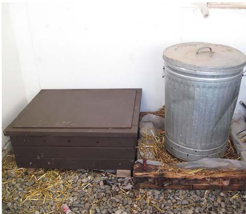
A vermicompost bin is placed in a greenhouse next to a trashcan composter.

Wherever you place your bin, be sure to monitor its temperature to make sure the environment inside is good for your worms.