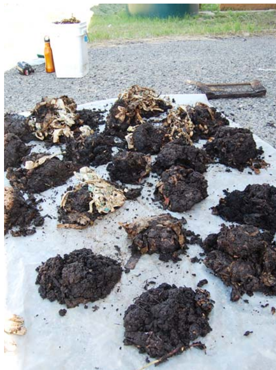
Worm bin castings have been removed from a worm bin and placed into piles that are ready to be separated out into vermicompost. Notice that the piles have been placed on a plastic sheet and are being kept out of direct sunlight.

Once all the worms have been separated from the castings, remember that any bedding that didn't break down can be used in your bin again.