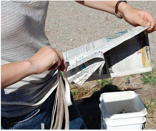
Newspaper torn into strips makes excellent worm bedding material.