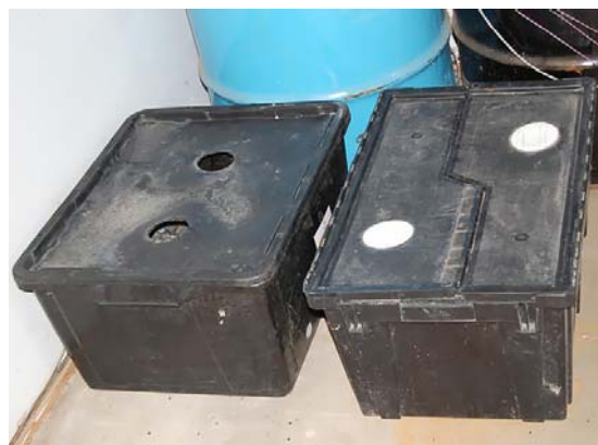
Modified plastic containers make great worm bins.

The lid needs to be tight-fitting to help regulate the temperature inside the bin and to keep light from penetrating the bedding and getting to the worms. Worms and light don't mix. An hour in sunlight will paralyze a worm and just a few hours of sunlight can kill it. Besides, you