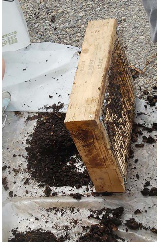
Fresh vermicompost is ready to add to soil after it has been hand sorted and screened.

You will need somewhere to place the worms; perhaps replace the bedding in the bin and put them there. Once again, any bedding that isn't broken down can be placed back in the bin.