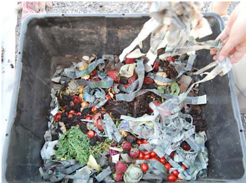
Produce nearing the end of its shelf life makes great worm feed.

It's helpful to refer to the brown, carbon-laden materials in your bin as the bedding. The green, nitrogen-rich, material is the food.