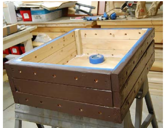
A wooden worm bin is being built.

Another popular option is to make bins from opaque plastic storage containers. It's an easier process than building a wooden container, and people often have spare containers around