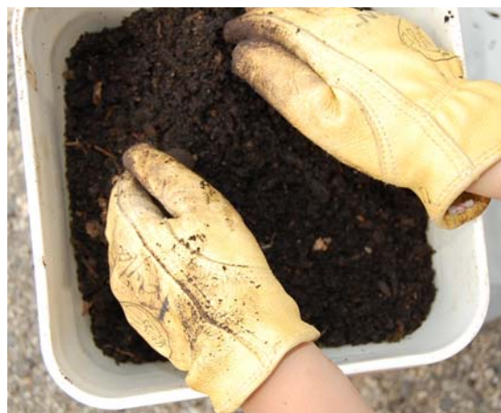
This bucket contains finished and fully separated vermicompost.

When there is significantly less bedding in the bin and castings have gathered at the bottom,