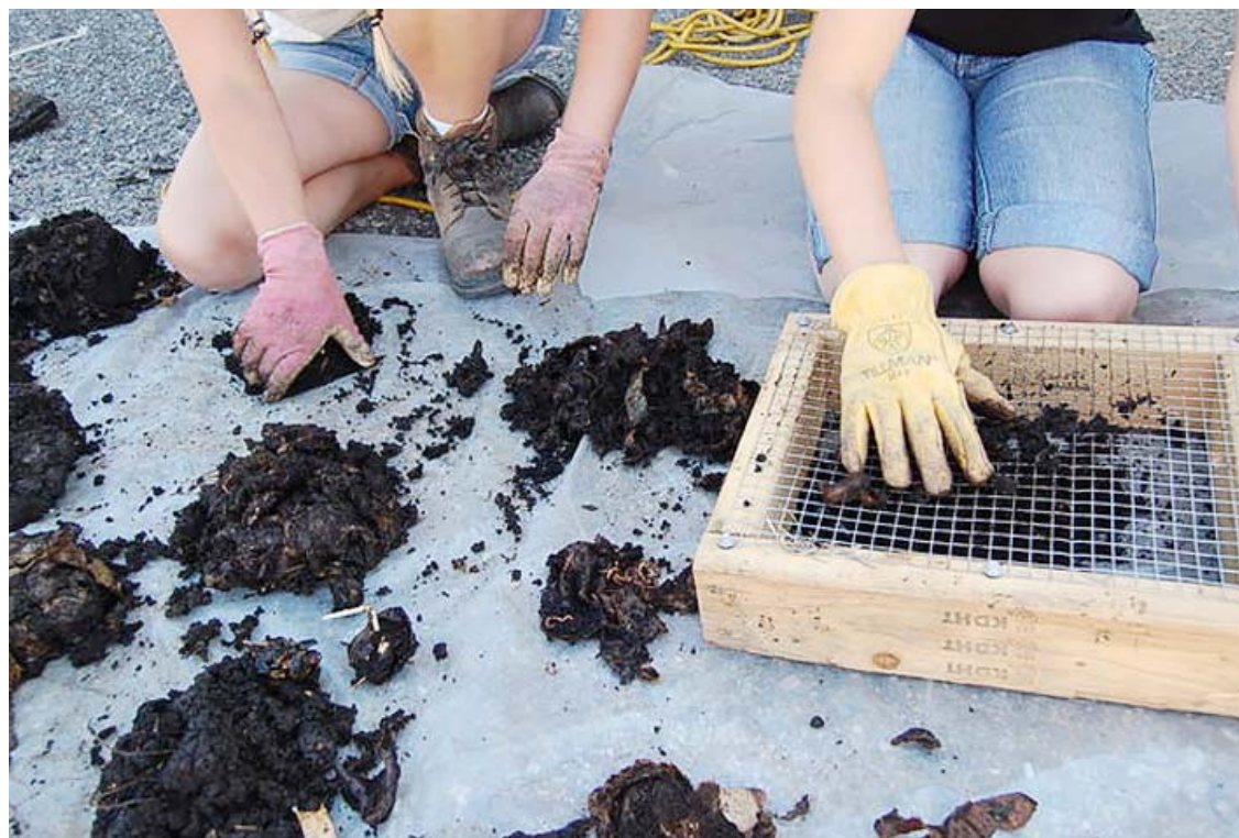
Worm castings are hand-sorted and fresh vermicompost is screened.

This publication is an introduction to creating and using vermicomposting bins to make compost. It covers the type of worms to use; food and bedding for the worms; introducing the worms to the bin; maintaining the worms through proper feeding and temperature regulation; and removing the compost from the bin. It also discusses various kinds of bins and how to make them. Finally, it includes a “troubleshooting” section with frequently asked questions concerning problems that might arise with a vermicomposting system.