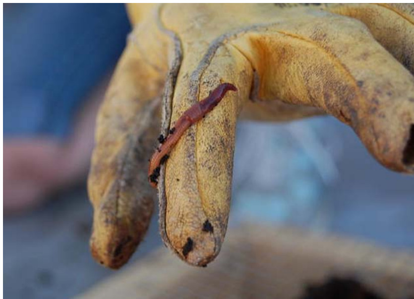
An Eisenia fetida worm, commonly known as a red worm.

The kinds of worms you're likely more familiar with, such as common garden worms, don't work well for vermicomposting because they aren't capable of breaking down high levels of organic matter. But even though you can't just go out in